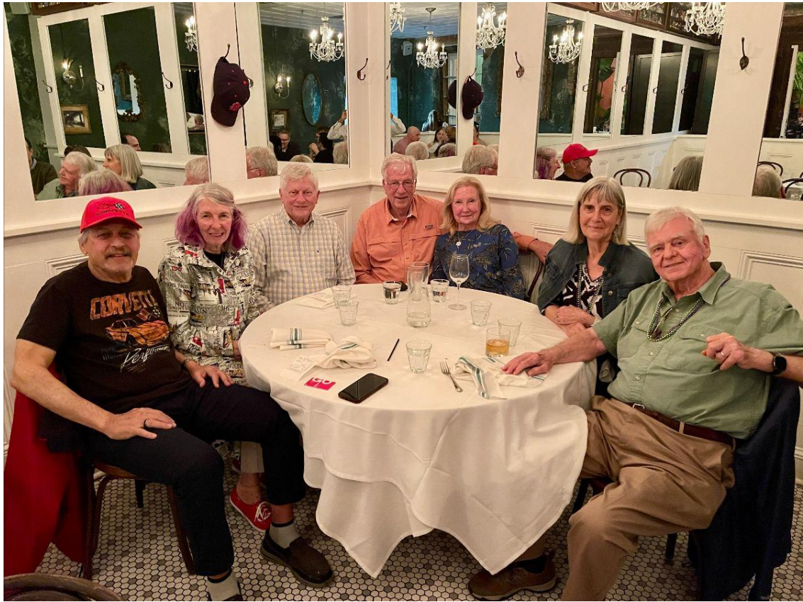
Above: The last STLCC Members standing (OK, sitting) at our table in Tujague's.