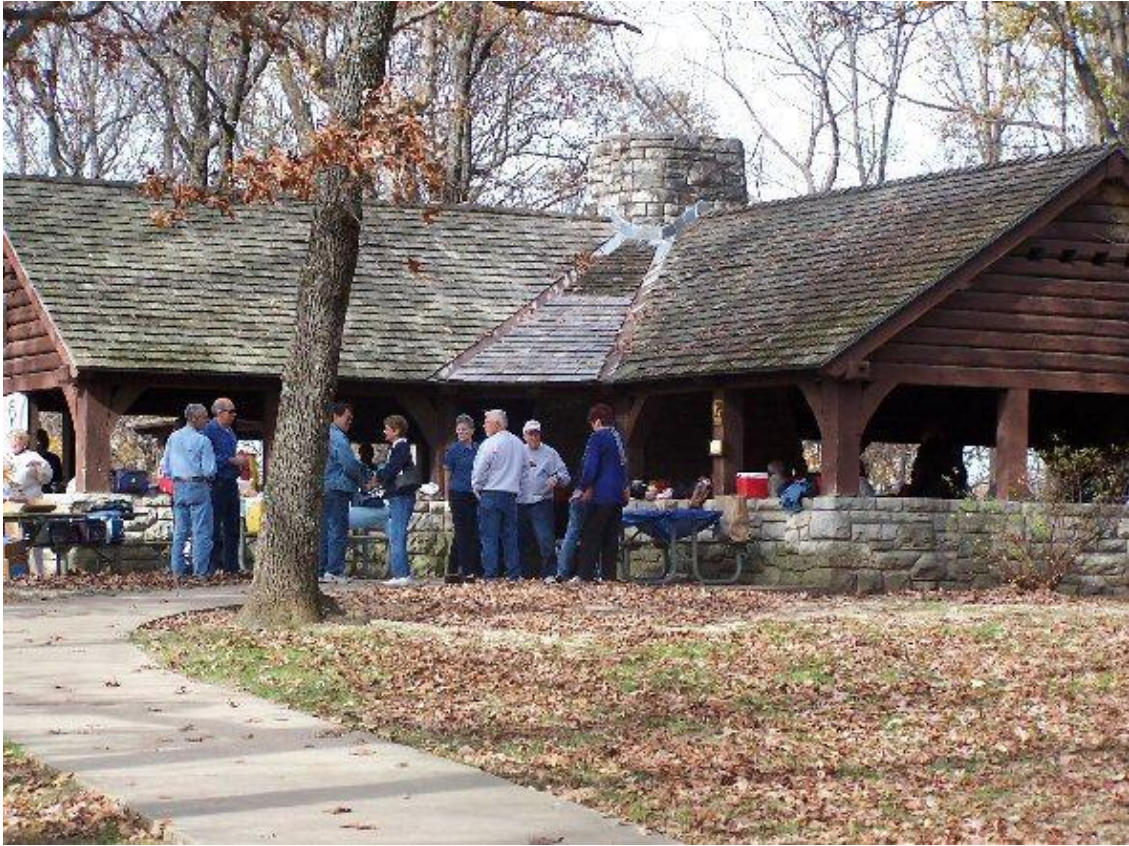
Our first picnic at Babler State Park from September 2005.