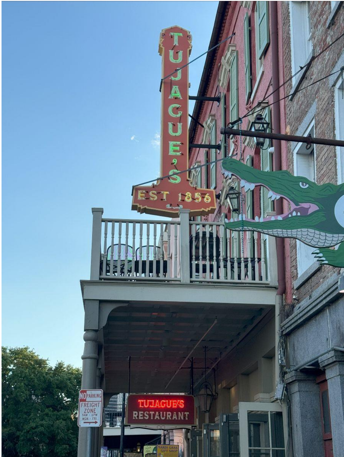
Above: Our Friday evening restaurant which has been in operation since 1856!