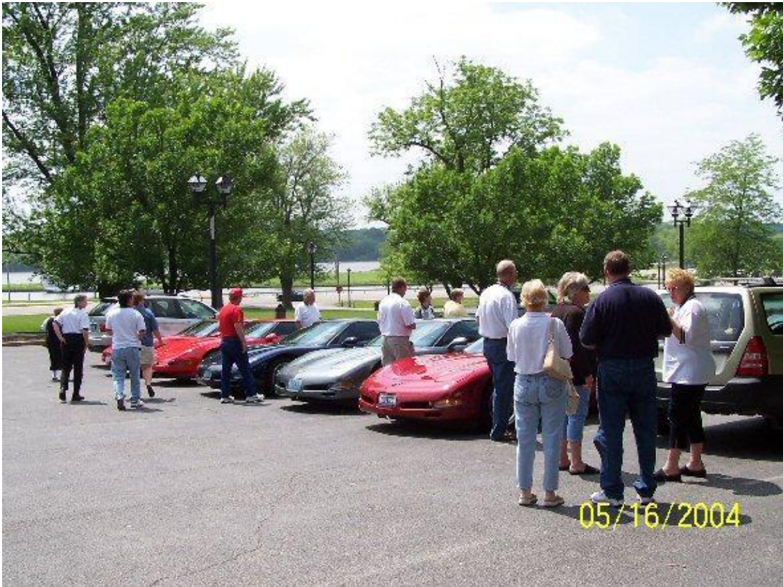
Getting ready to eat at Pere Marquette State Park in May 2004.