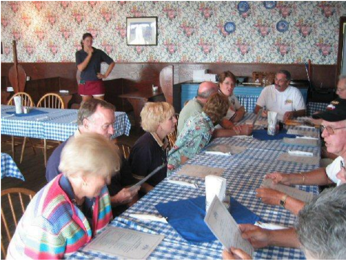
Doing what we do best on a winery run to Indiana in July 2004.