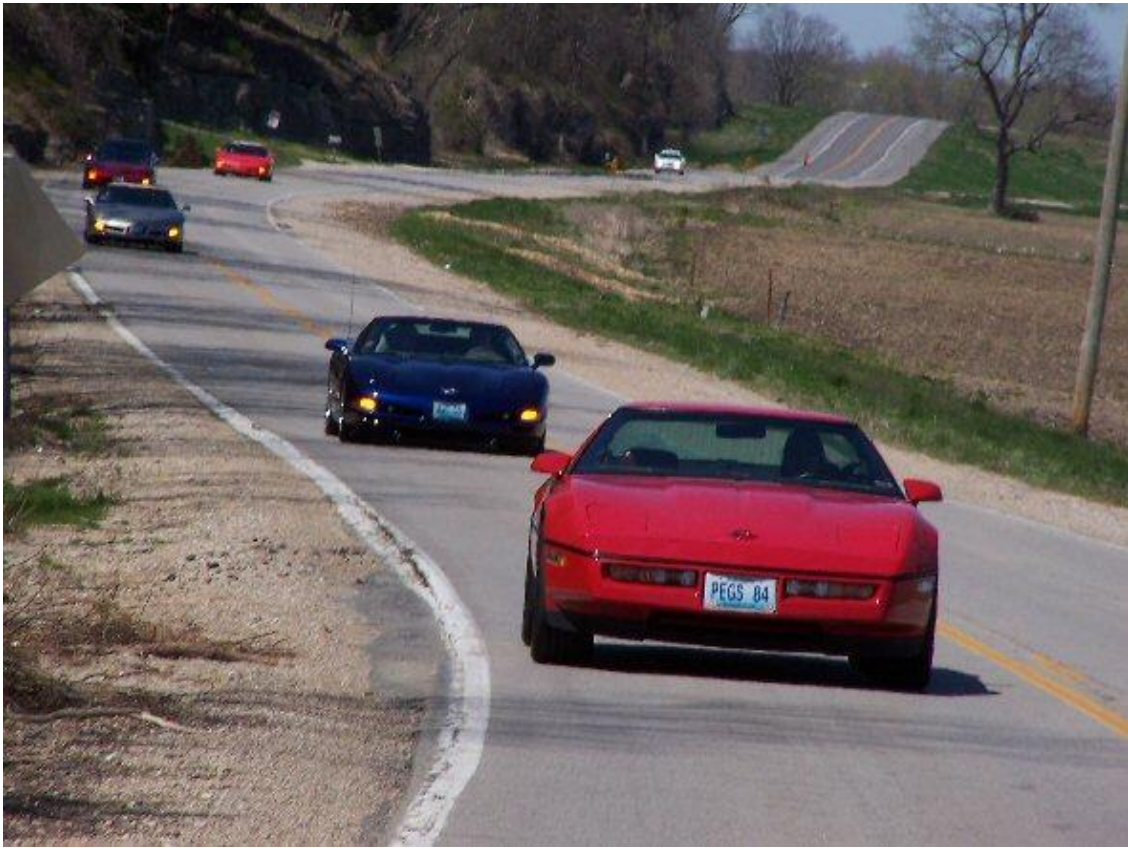
A few of our cars going on a run in April 2004.