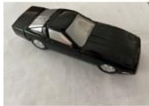
C4 Avon bottle (full)