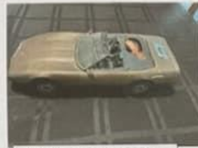
Whiskey Decanter C4