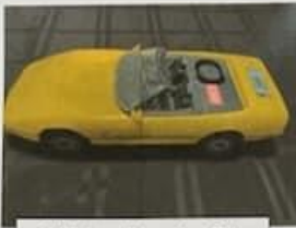
Whiskey Decanter C4