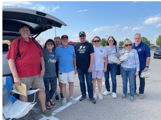
Picking Up the Pork Loins