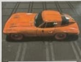
C2 - Wood Carving