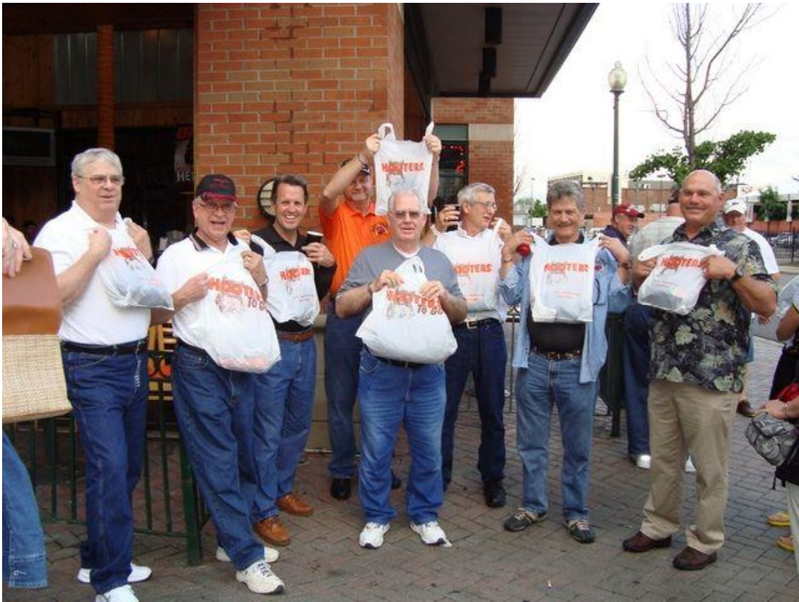
On a trip to Tunica in May 2010, while the ladies were gambling we know where the boys went!