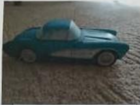
Whiskey Decanter C1