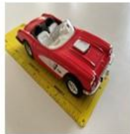
Red Corvette Corgi 6" long