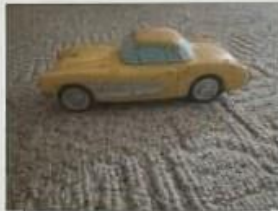
Whiskey Decanter C1