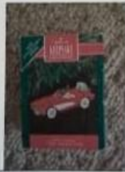
First of a series 1957 Ornament