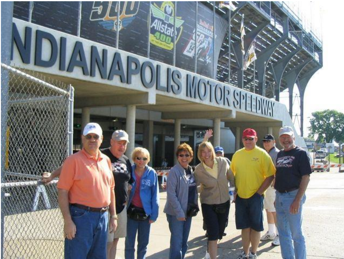
In May 2008 several club members trekked to the Indy 500.