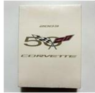
Unopened VCR that came with purchase of a new 2003 50th anniversary car