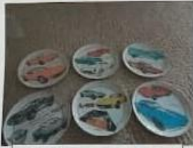
Set of Vette Vue Plates