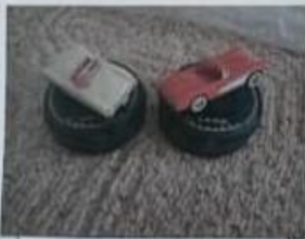
1953/1956 Music Boxes