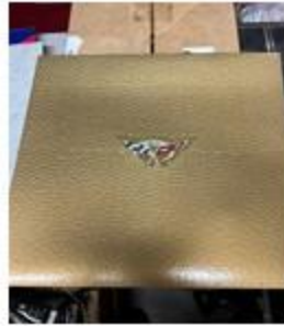
Unopened dealer brochure for the 2003 50th anniversary