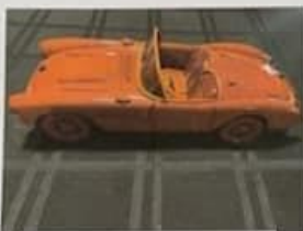
C1 - Wood Carving