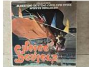
Dealer's Choice board game from 1975