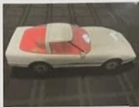
Whiskey Decanter C4