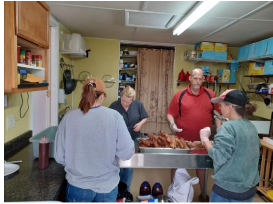
Preparing and smoking the pork loins.