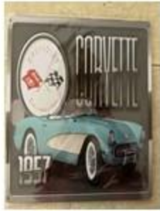
Large 15"x17" metal sign