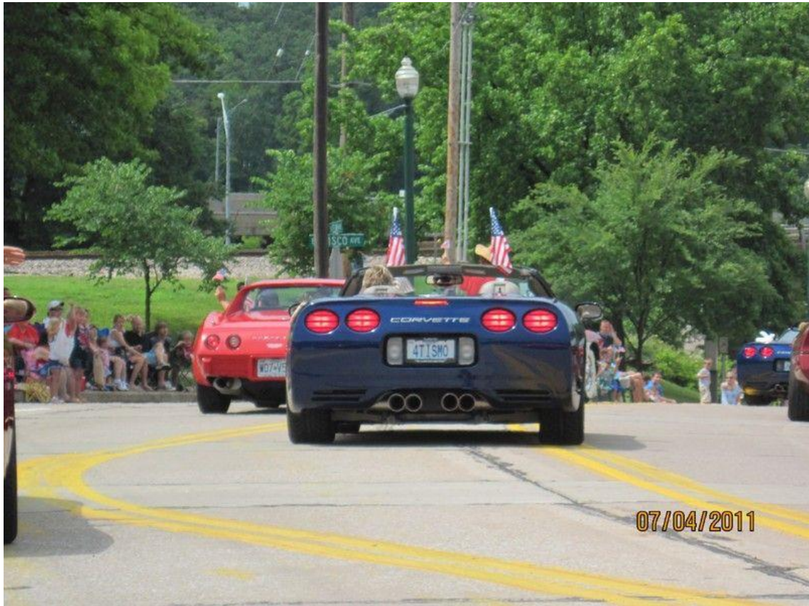
Some of our decorated cars in 2011.