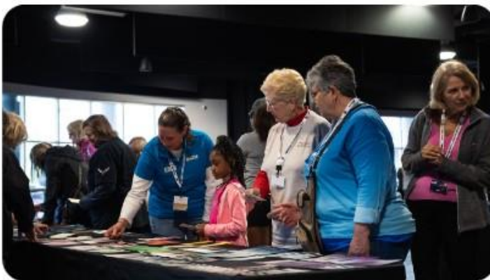
Pictured above is a group of attendees at Ladies Garage 2023, an event brought back to the NCM Bash thanks in part to the Sisterhood.