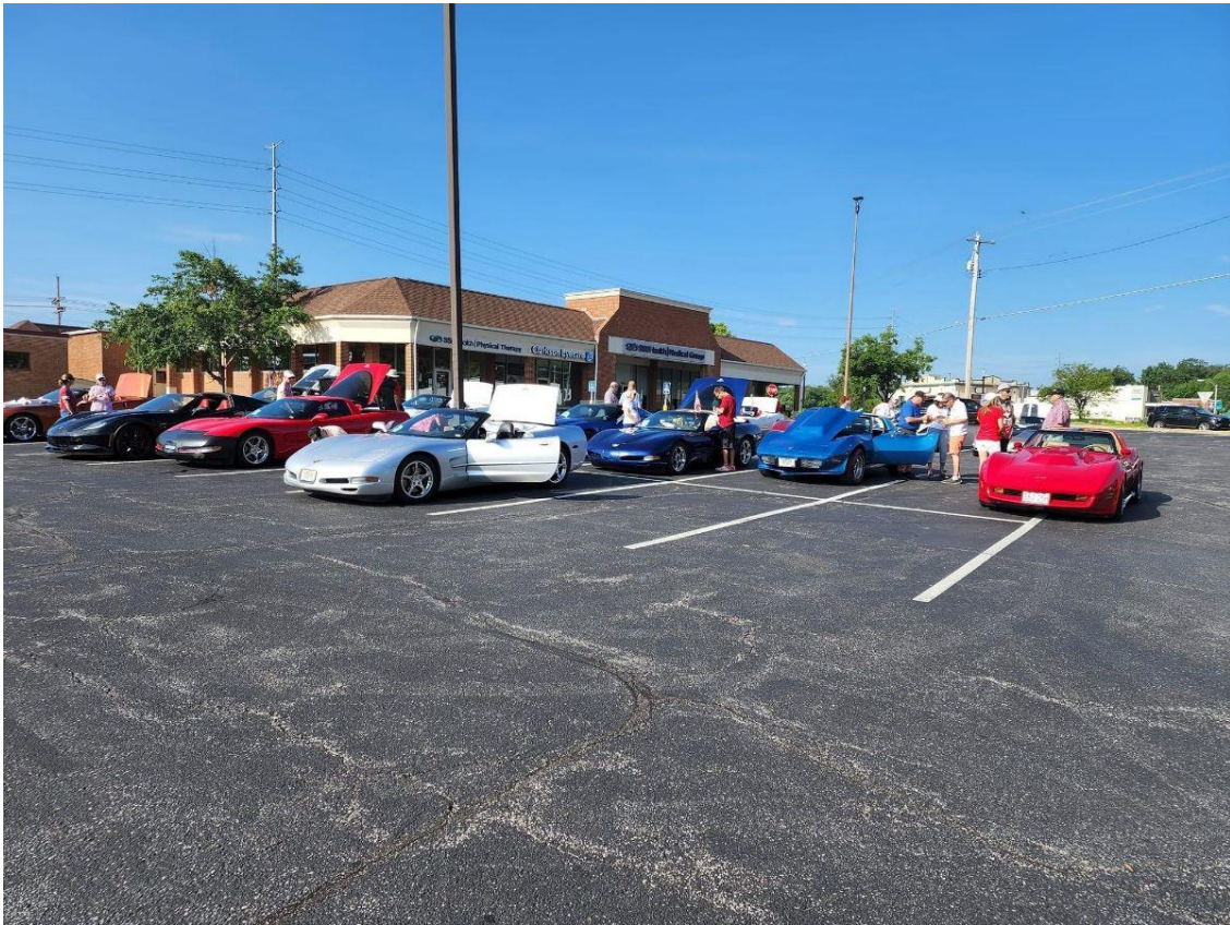
Getting ready for the 2022 parade.