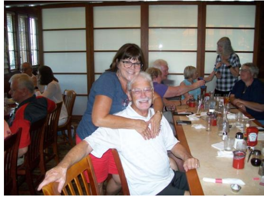
Sugar Creek Winery