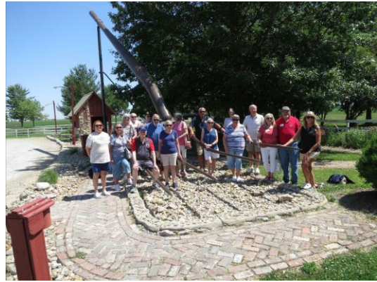
Above: The group standing with the Biggest Pitchfork just outside the Richards Farm Restaurant.