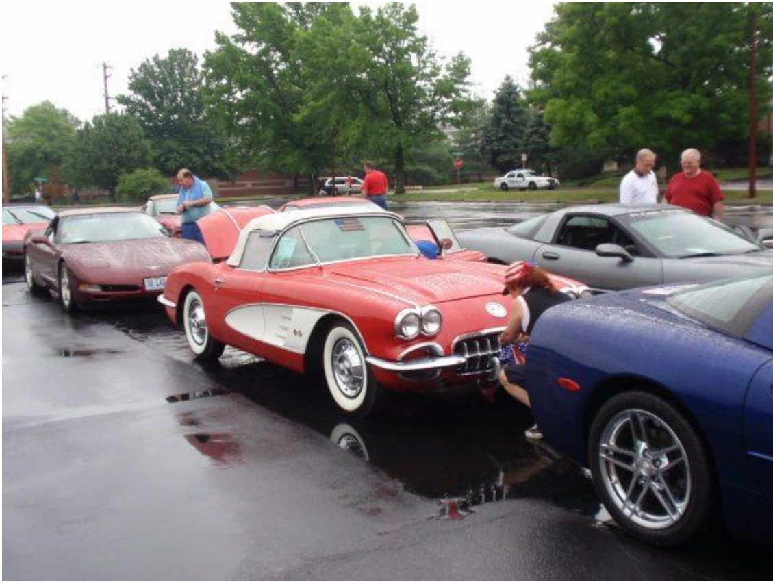
A mad dash to clean up our cars after a rain storm in 2009.