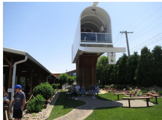
Some of the group sitting under the mail box enjoying ice cream.