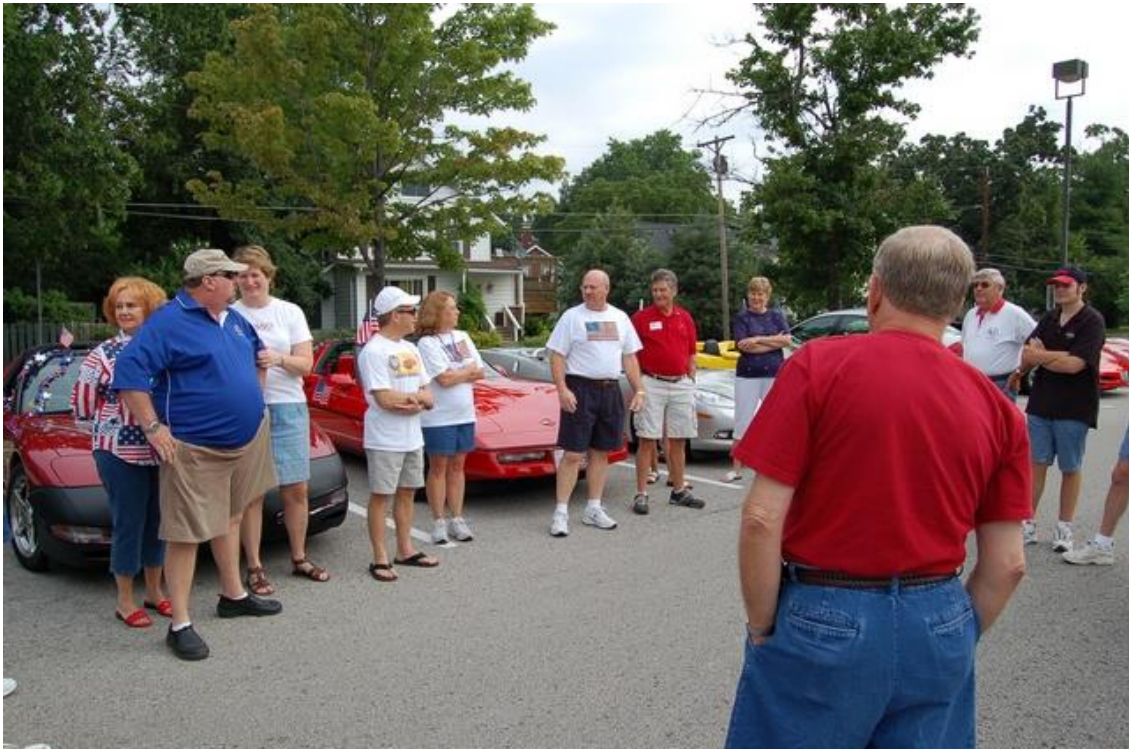
Drivers meeting prior to the parade in 2008.