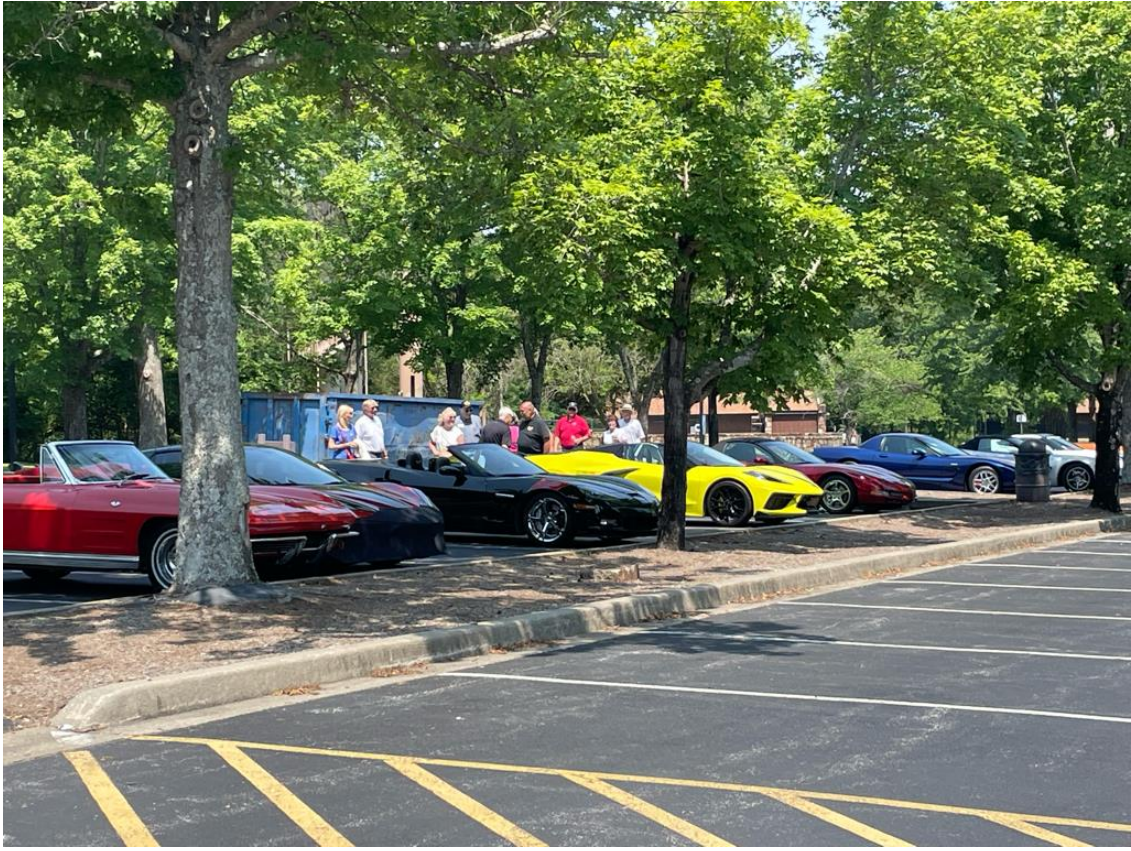
Third Stop - Chaumette Winery