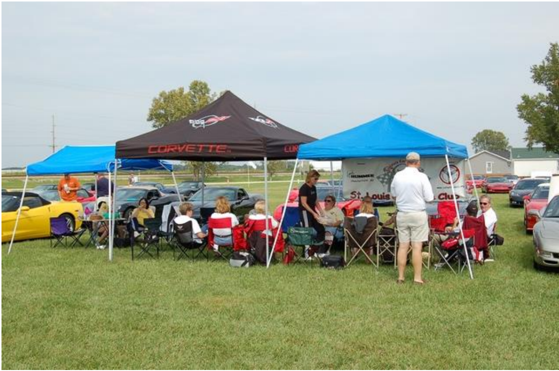
Club members attending Funfest in September 2014.