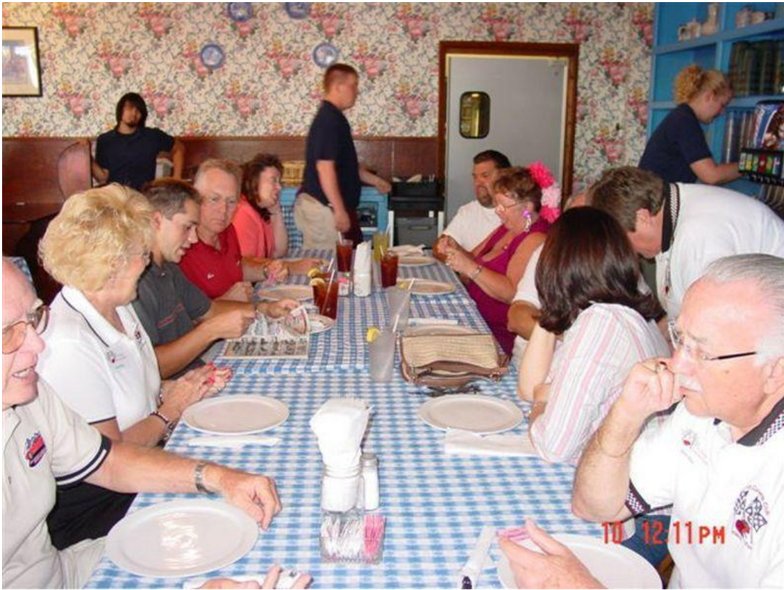
Club members from our trip to Blue Springs Café in September 2008.