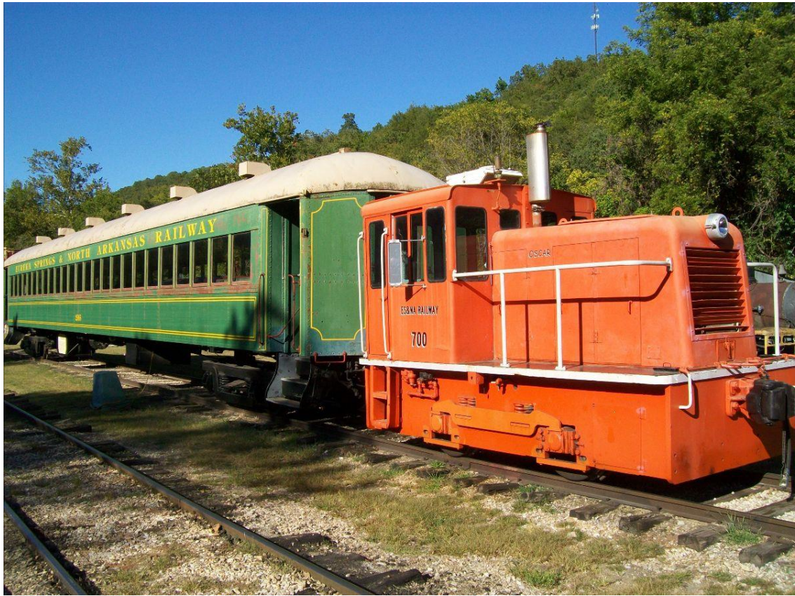
Eureka Springs & North Arkansas Railway