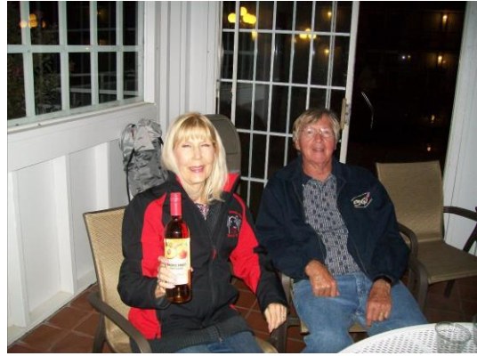
Relaxing in the gazebo.