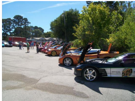
Corvette Car Show