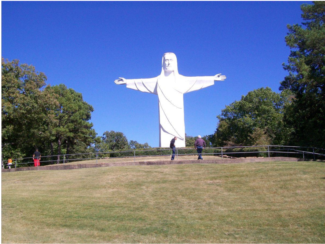
Christ of the Ozarks Statue