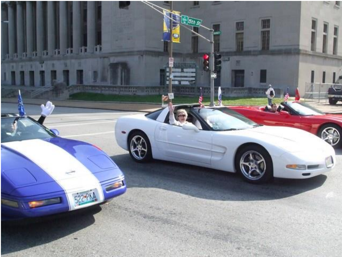
Our traditional red, white and blue cars at the end of the Veterans Day Parade in 2007.