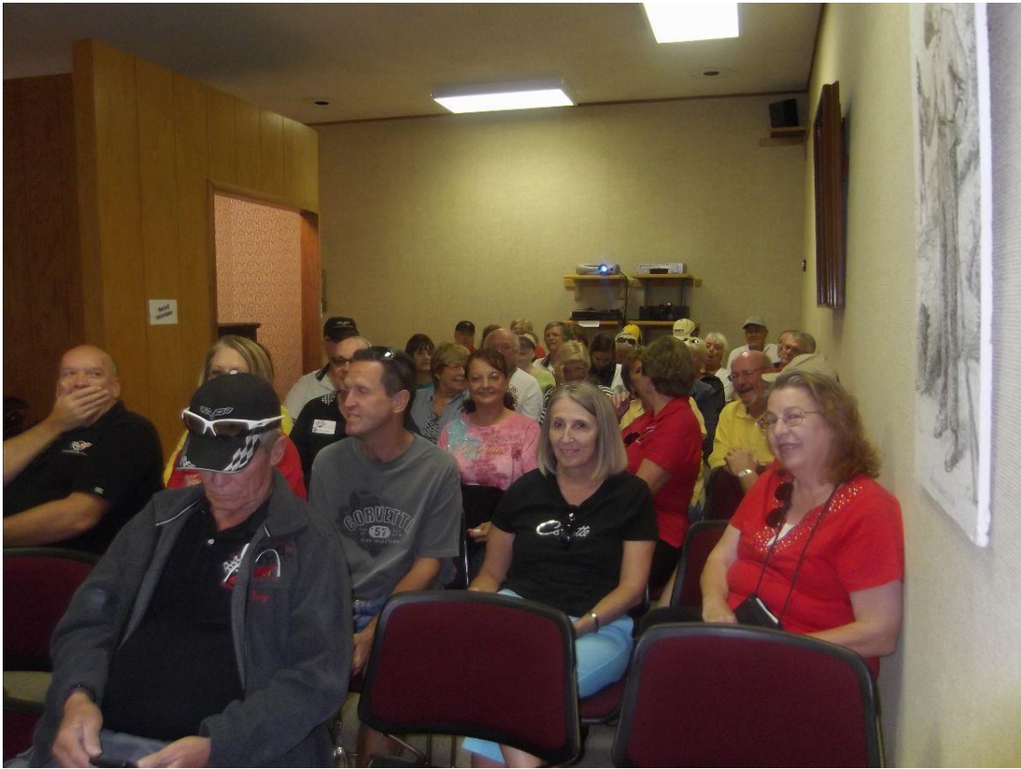
Club members who participated in a mystery run in 2012. We ended up at the Veterans Memorial in Perryville and Mark Twain Lake.