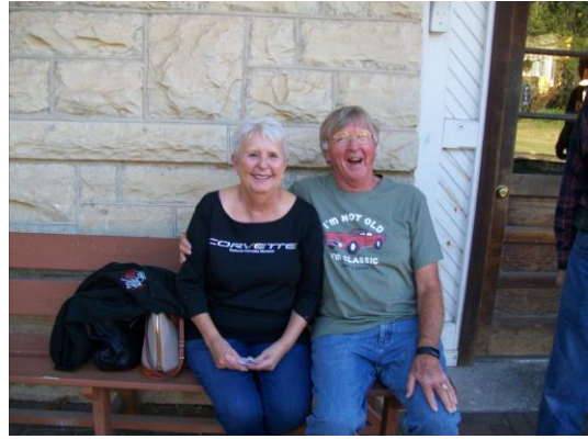
Waiting for the train to arrive.