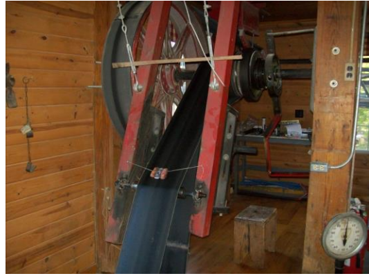
War Eagle Mill