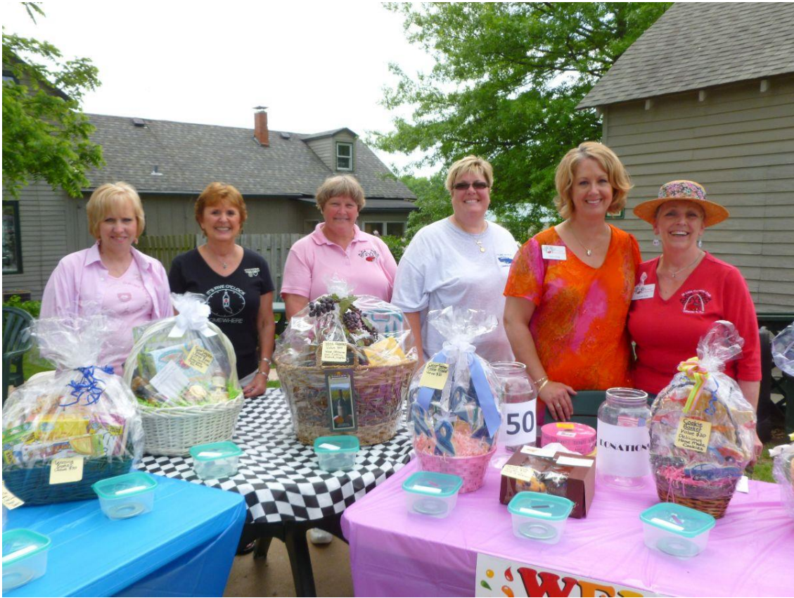
Club members raffling items at the Armynta Craig Memorial Winery run in May 2014.