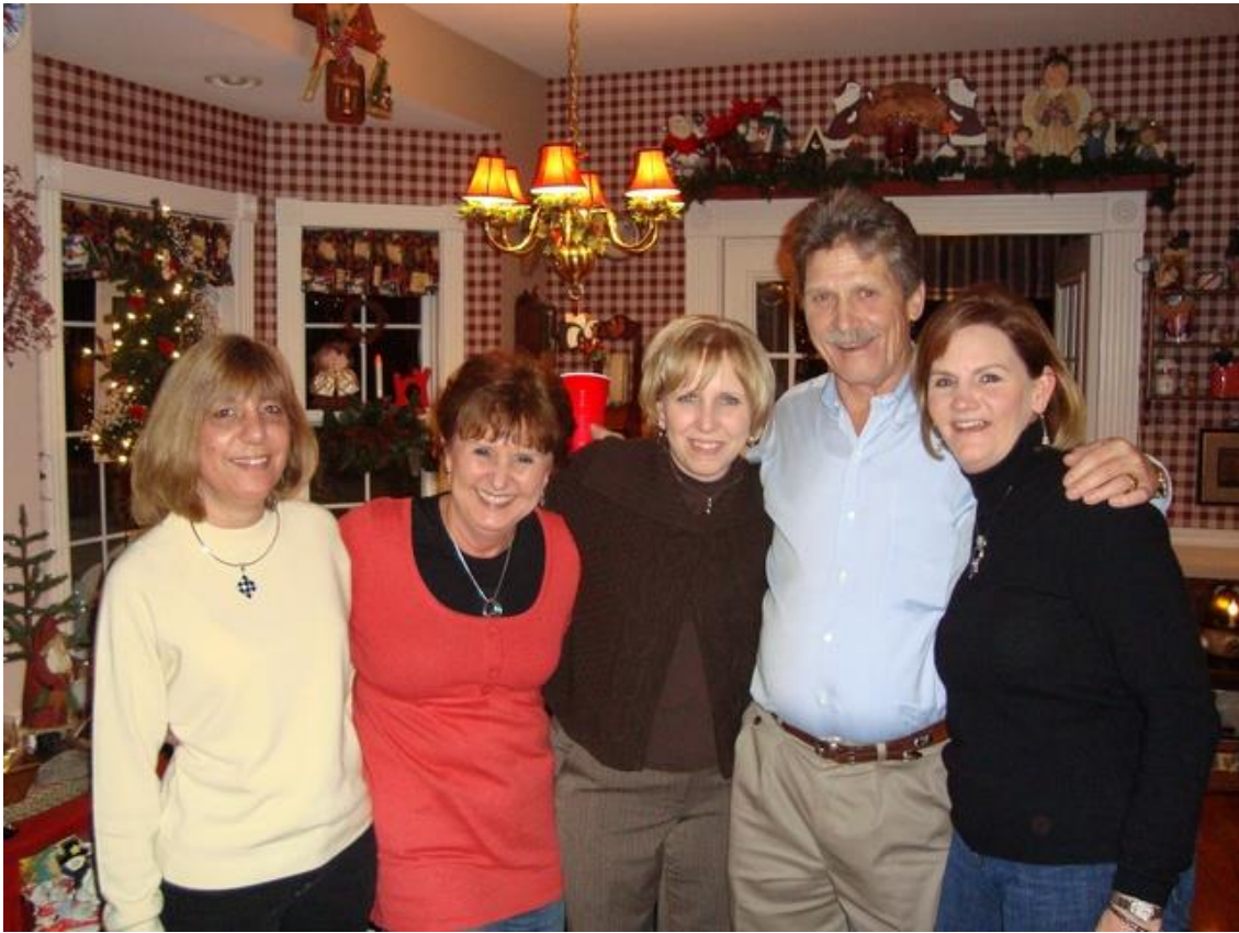
From 2009, this picture was titled "Stimey, Darla, Marla, Buckwheat and Carla". You'll have to guess who was who from Our Gang.