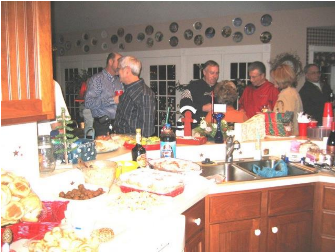
And from 2008, the most popular location in the Prices' house.