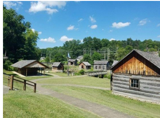
Above: Old Bardstown Village and Civil War Museum