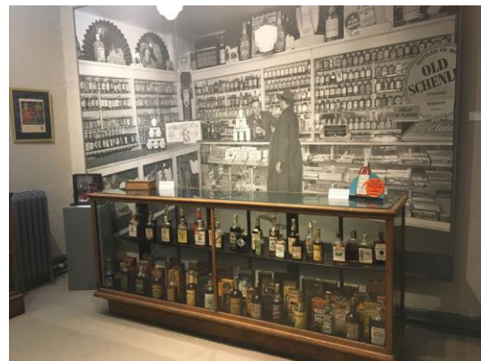
Above: The Oscar Getz Museum of Whiskey History