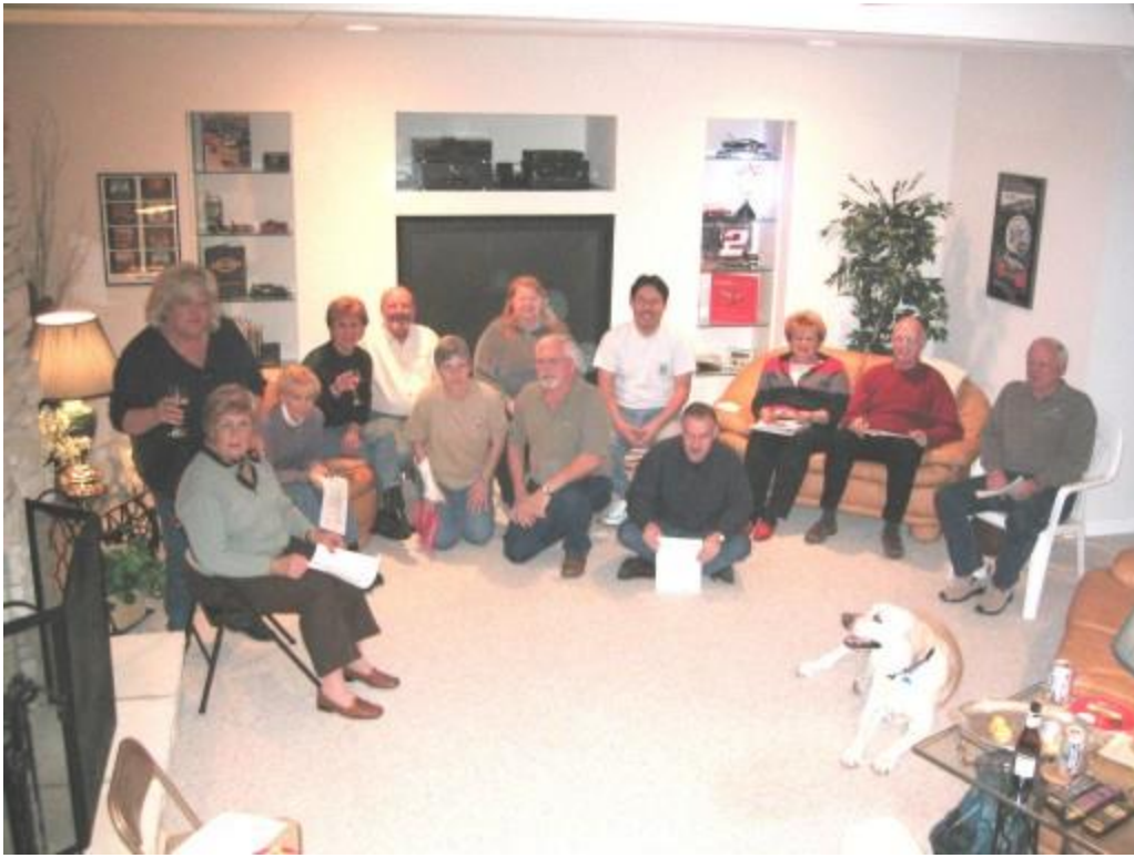
The first informal meeting of the founders of the St. Louis Corvette Club.