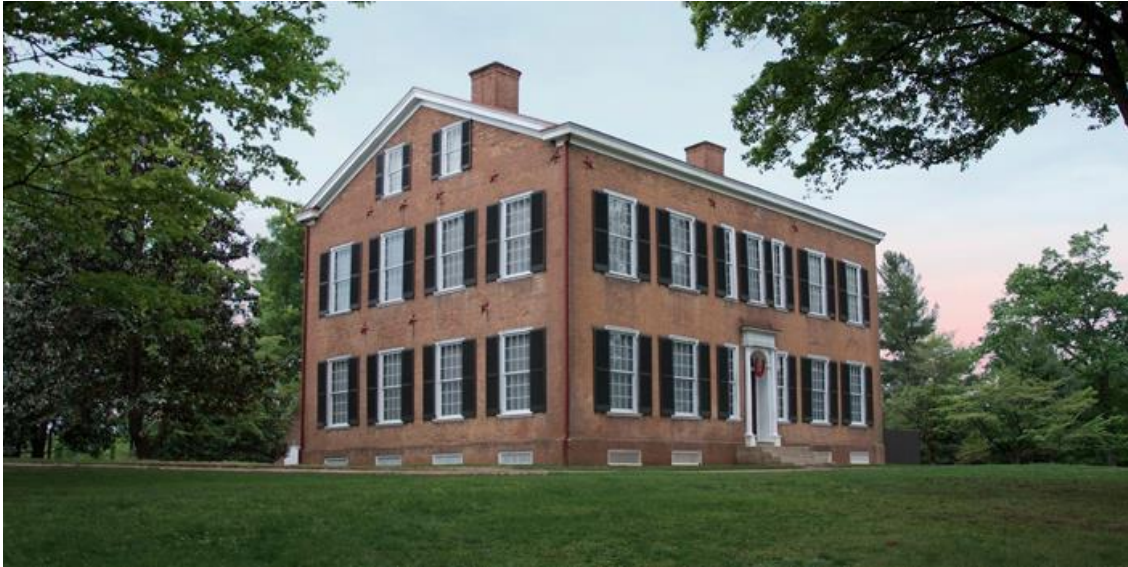
Above: My Old Kentucky Home