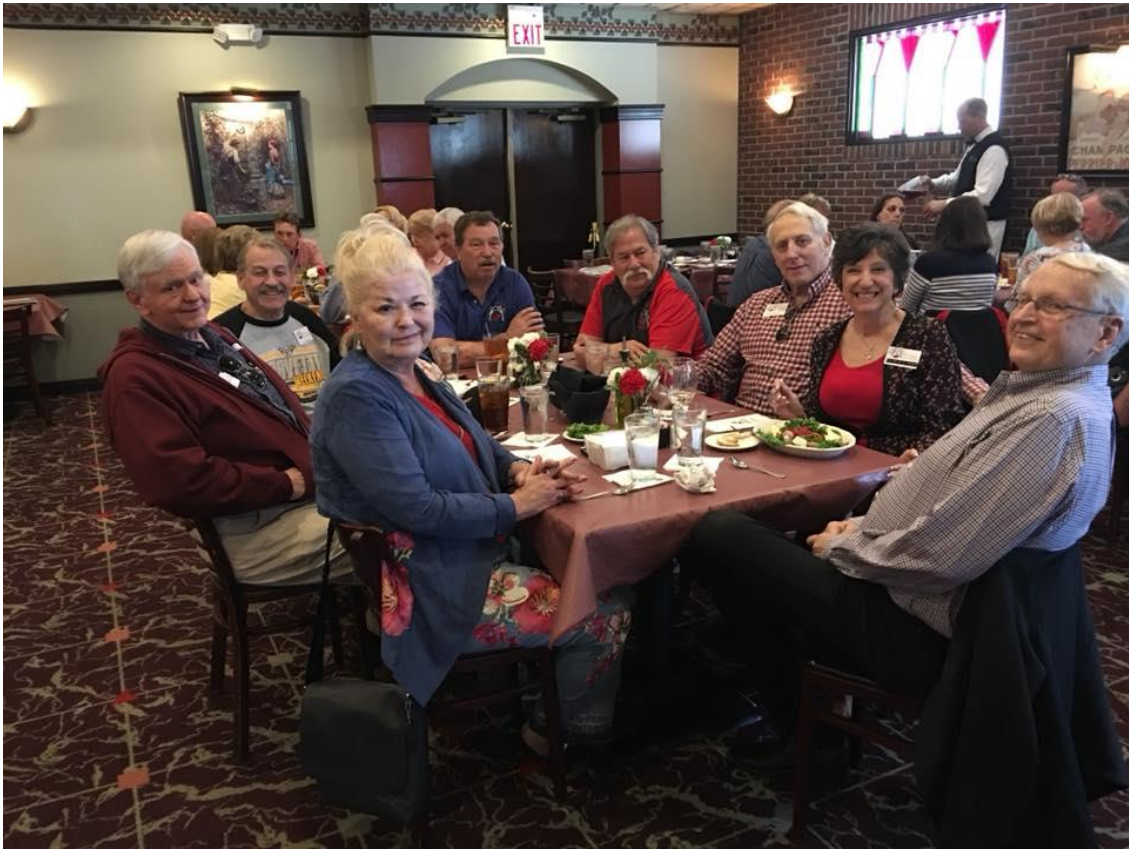
A group of well-fed members after visiting Favazza's in April 2018.