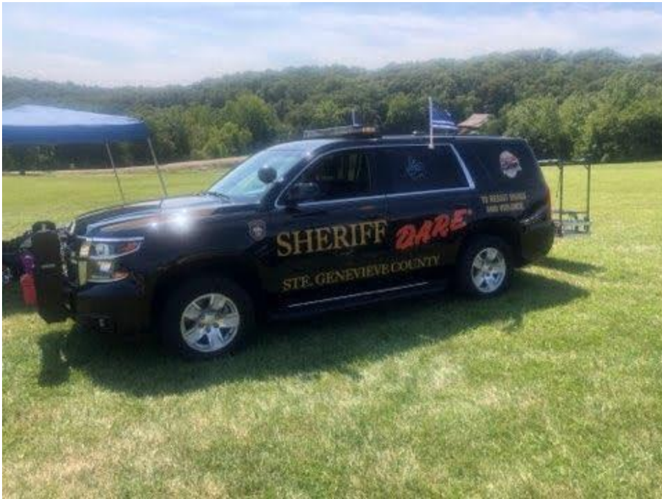
The DARE officer from Genevieve County joined us.