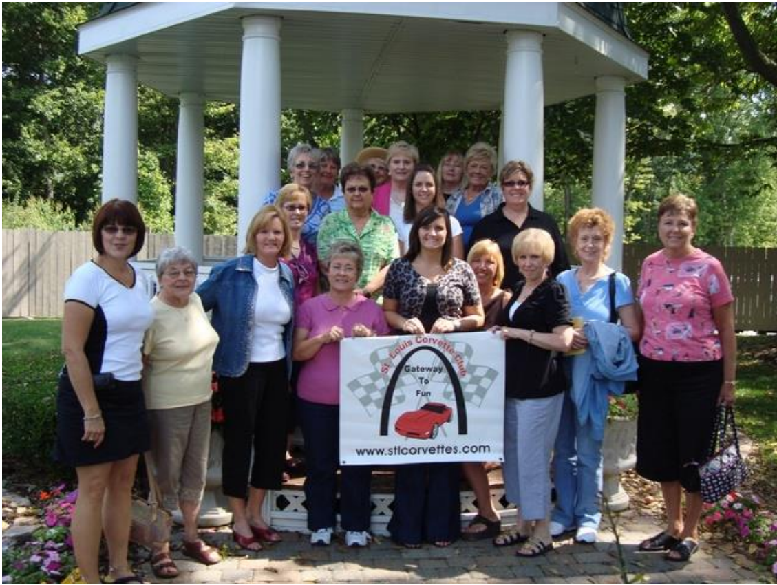
Josephine's Tea Room attendees from September 2009.