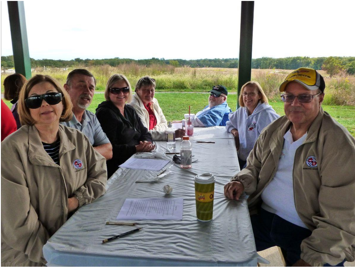
Members at the club poker run and picnic from September 2011. Hey, Dana had hair!