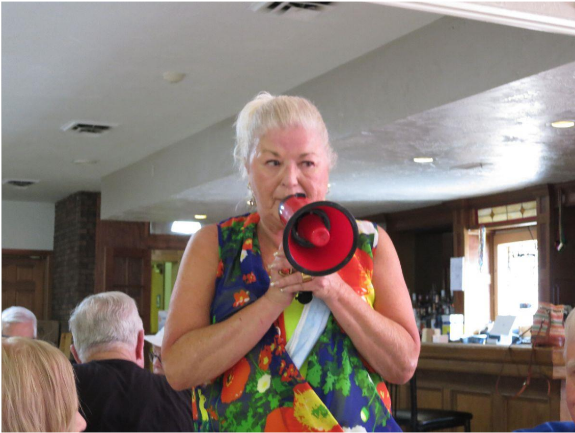
Alright, listen up everybody!