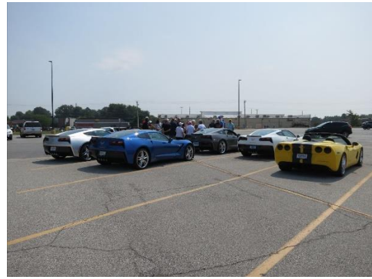
Preparing to start the Mystery Run at the Waterloo Walmart.