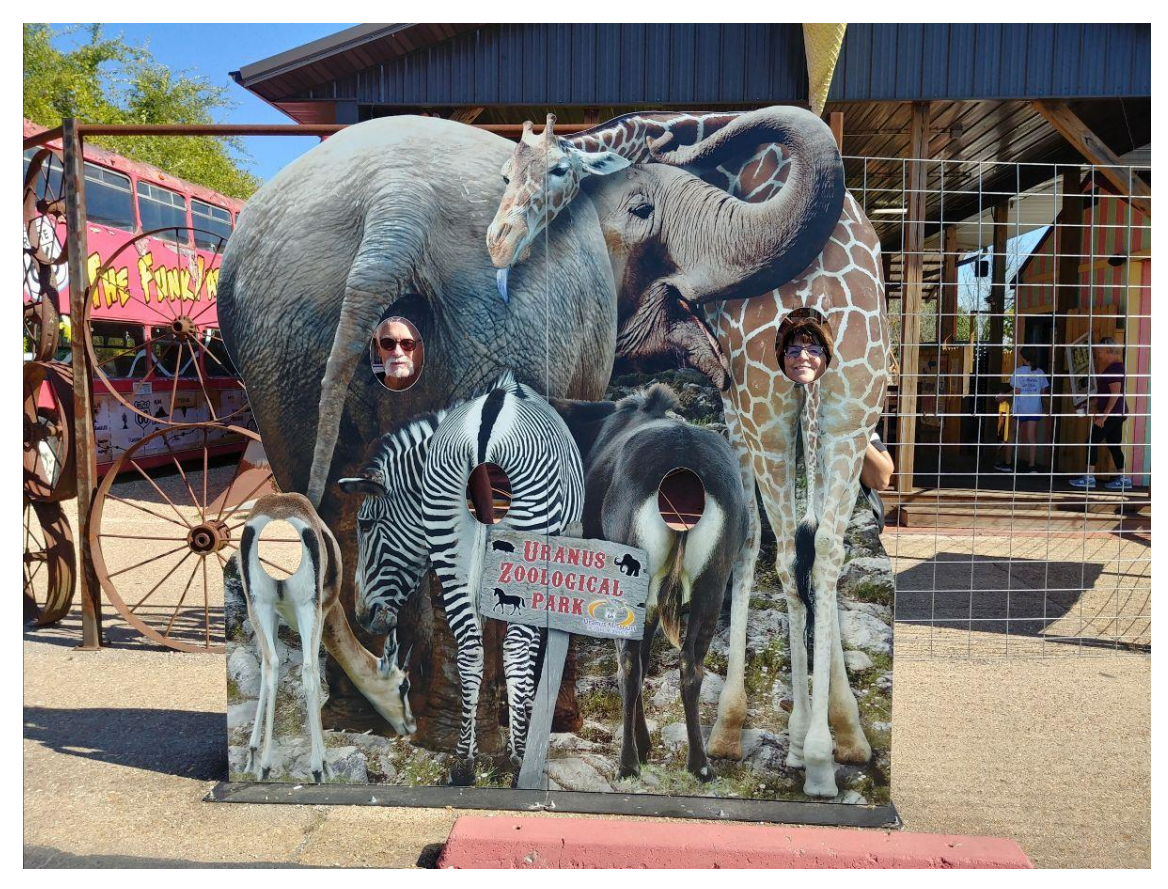
Price's heads sticking out Uranus