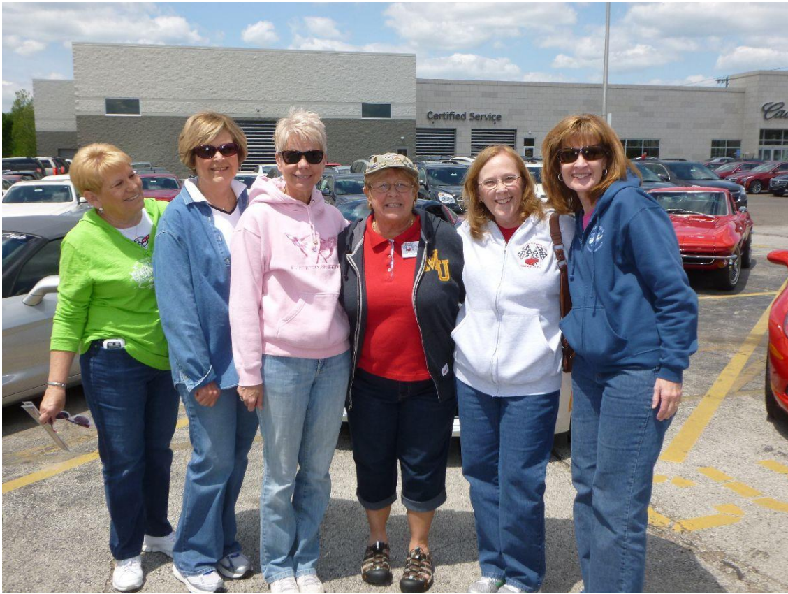
Some of the fairest club members at our car show in May 2014.