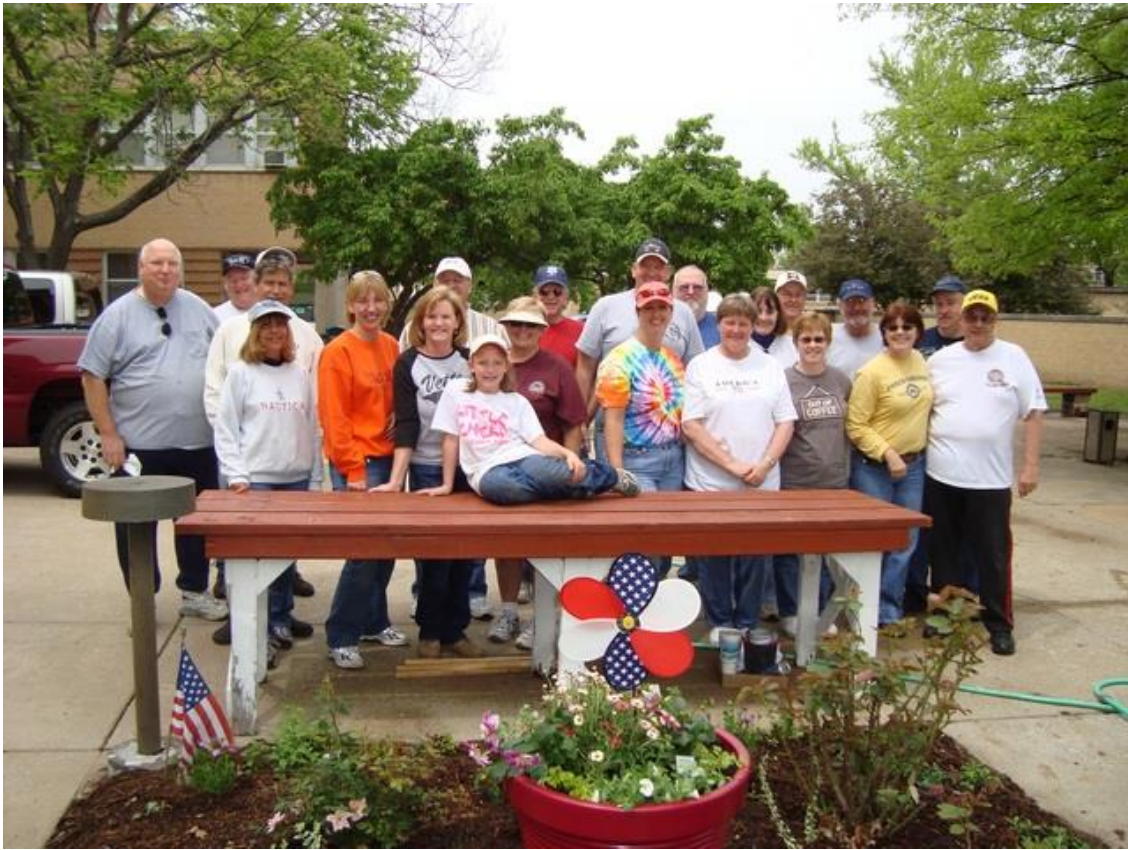
Some of the garden planters from our spring cleanup at the VA hospital in May of 2009.