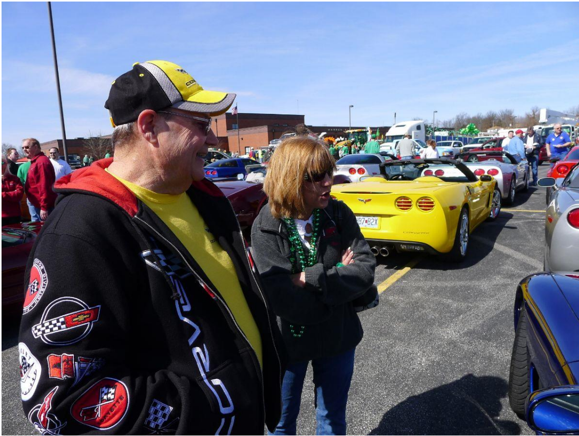
Getting lined up for the St. Patrick's Day parade in Cottleville in 2011.