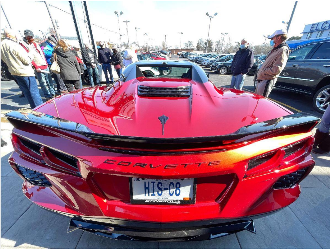
Howard's Rear End!