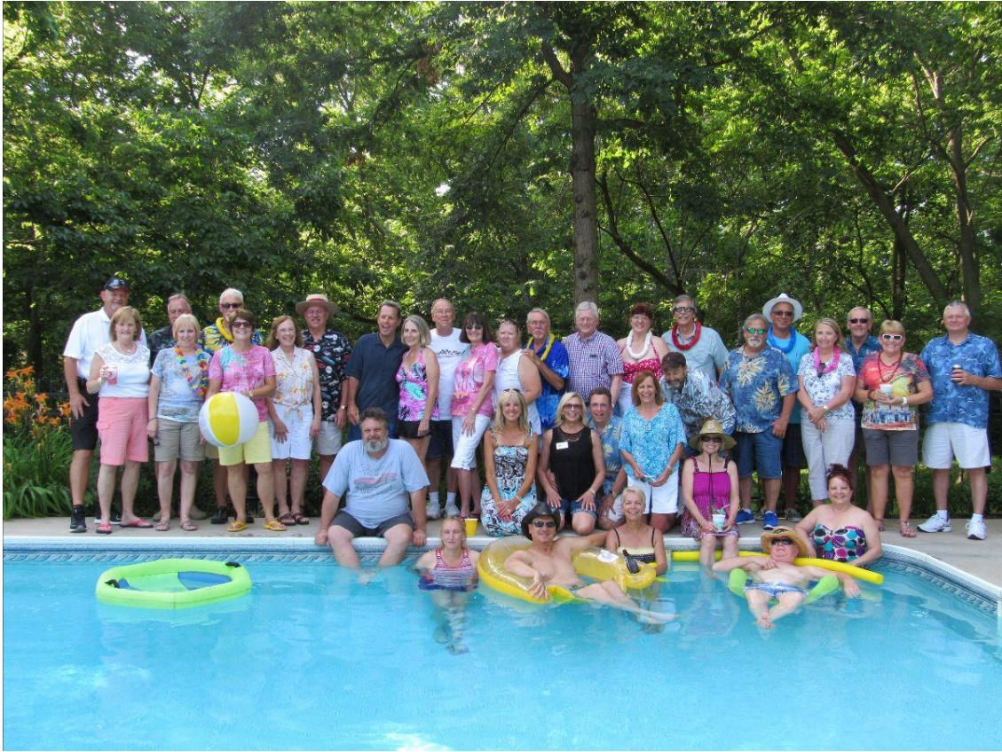
Club Luau at the Grubbs' house in June 2015.