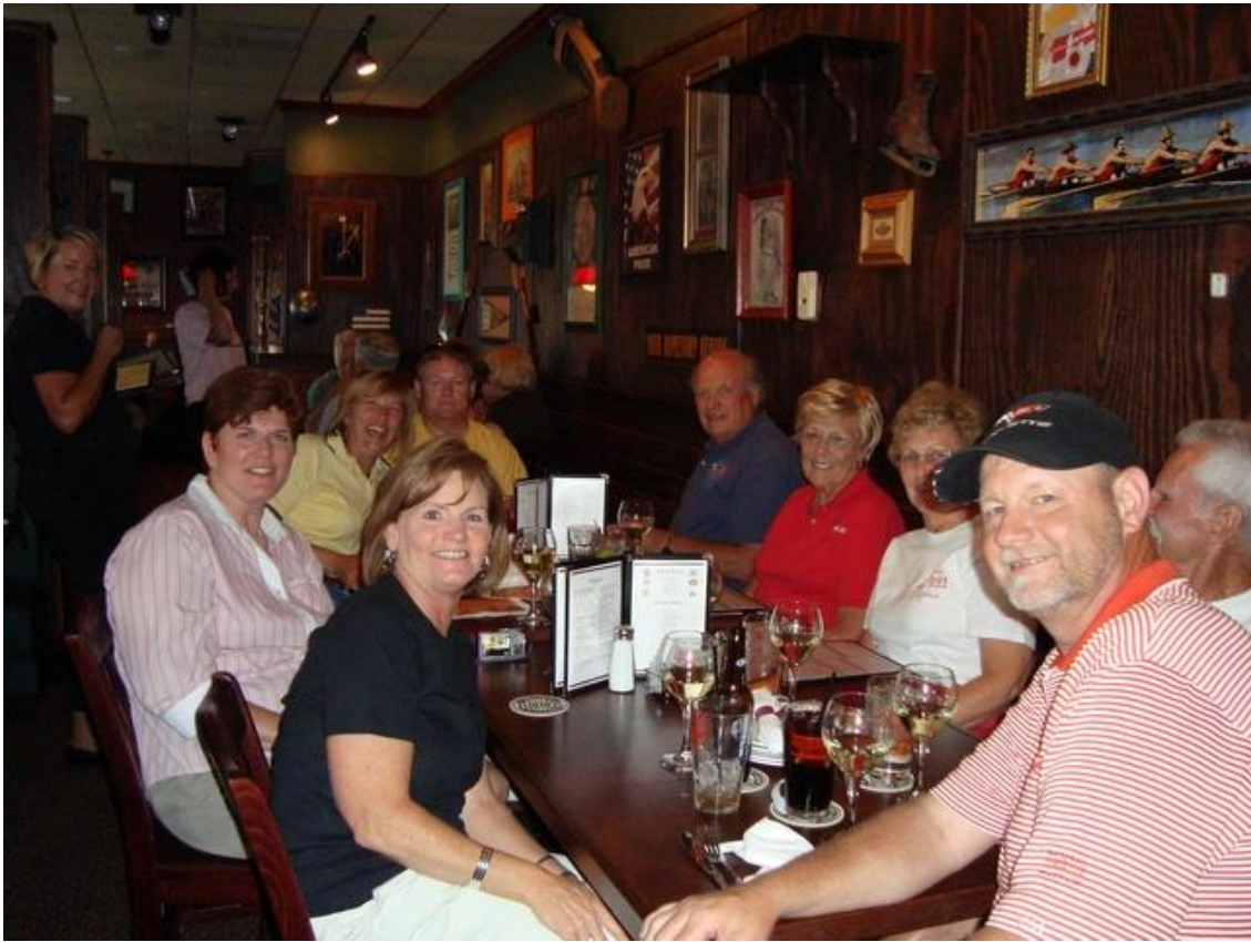
From June 2009, some of our members at Stonewolf for Happy Hour.