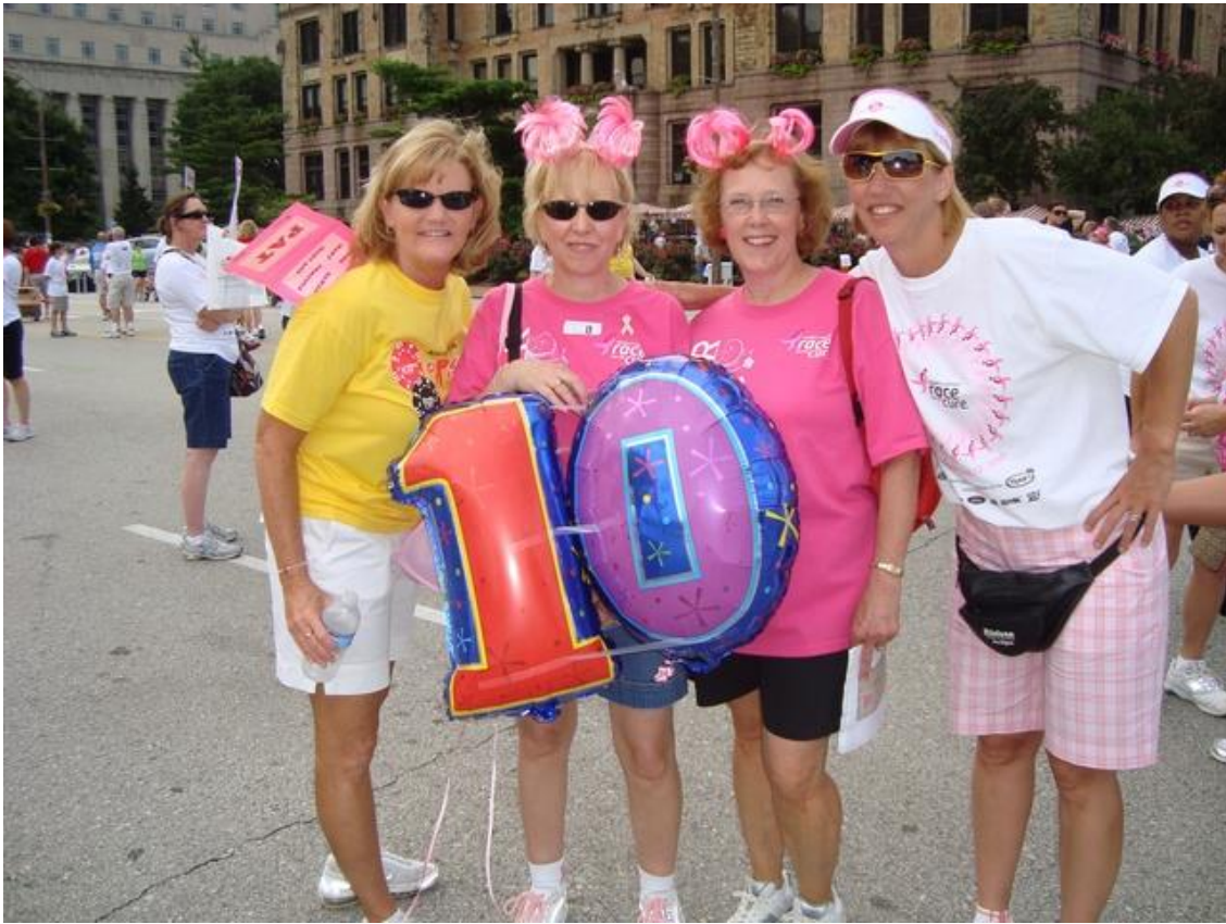
Some of our members participating in the Susan G. Komen Breast Cancer Walk in June 2010.