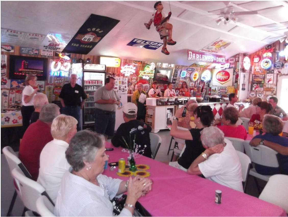
Some of our members having lunch at Bob's Gasoline Alley in Cuba, MO in June 2012.