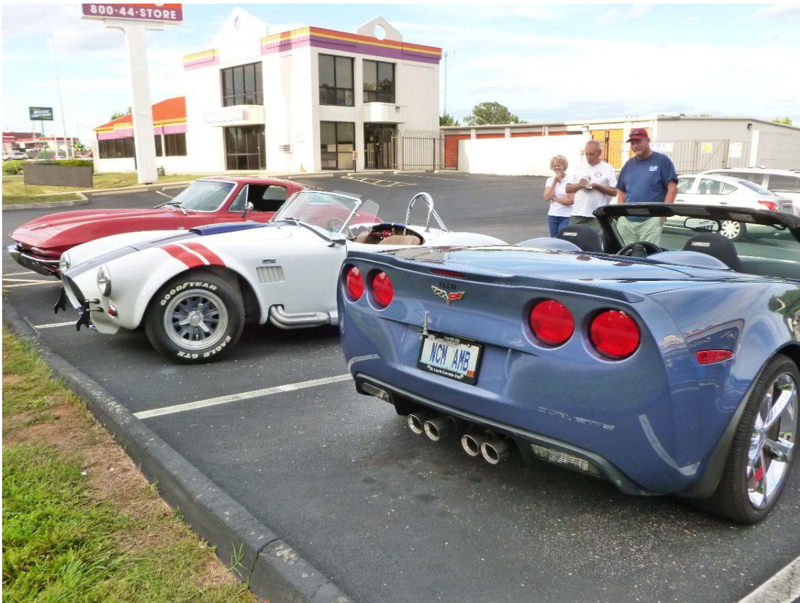
Nice mix of cars for our Fritz's Ice Cream run in July 2013.