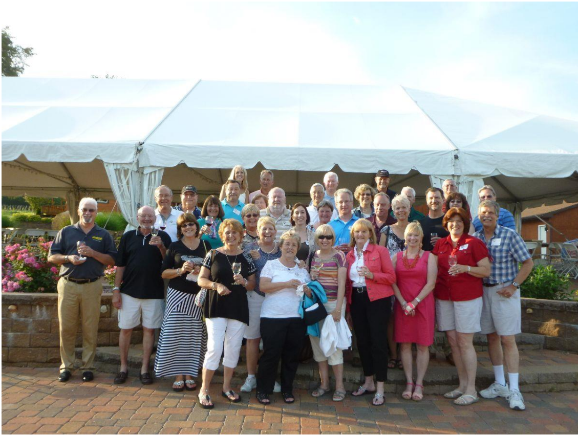
All the “winos” who attended the Villa Antonio Winery dinner in May 2014.