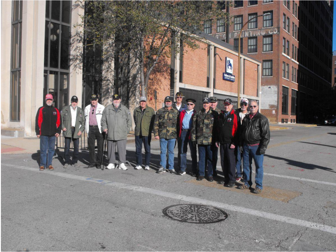
Some of the Veterans in the St. Louis Corvette Club.