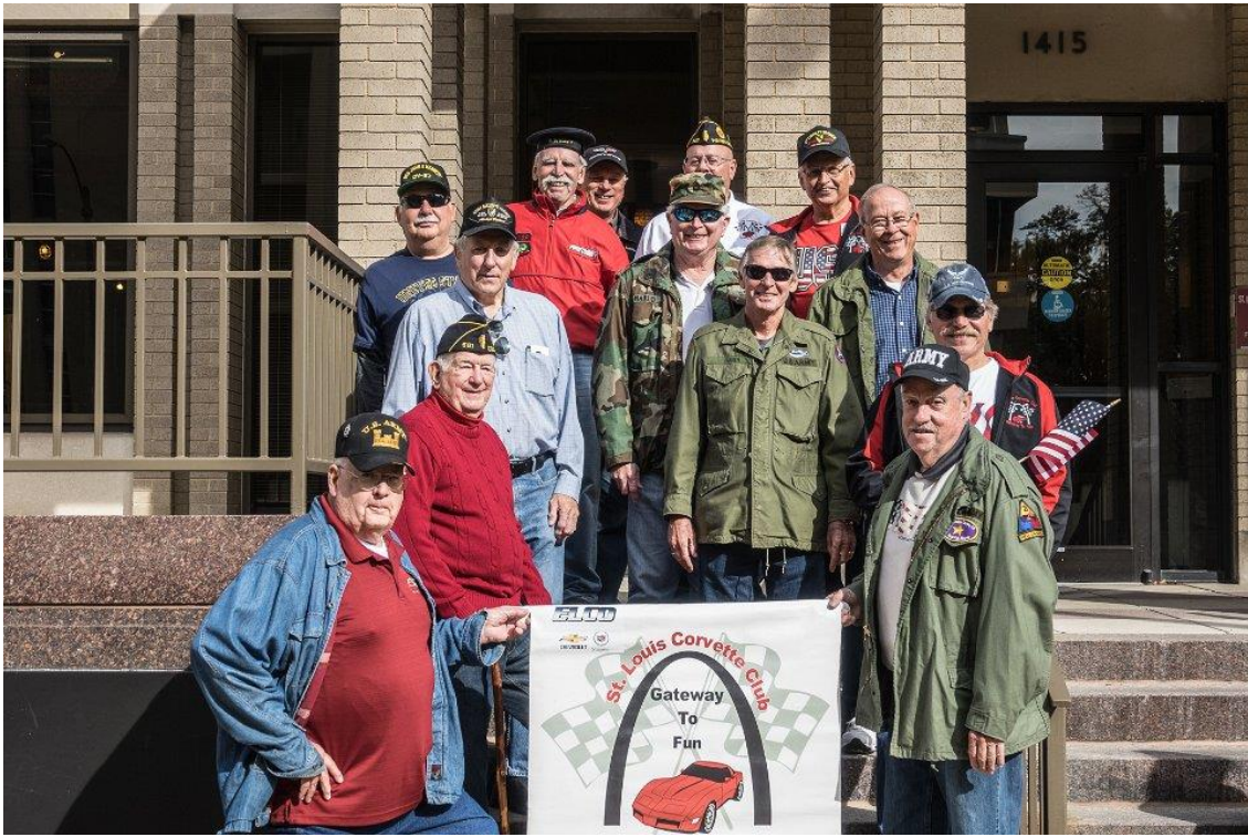
Our club veterans from the Veterans Day Parade in November 2016.