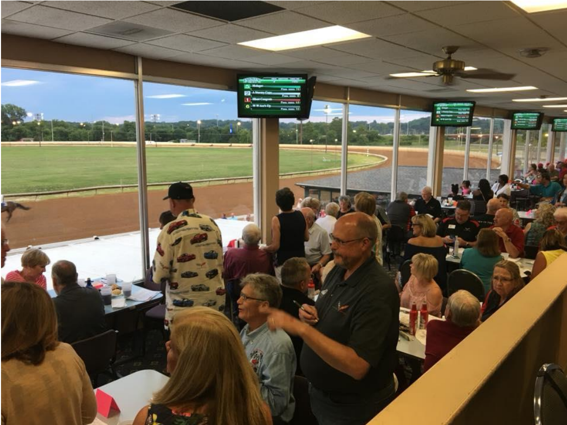
Winners (and a couple of losers) from our trip to Fairmount Park in July 2018.

Obviously sisters-in-law were not getting along when the club visited the Missouri Penitentiary for a tour back in March 2017.