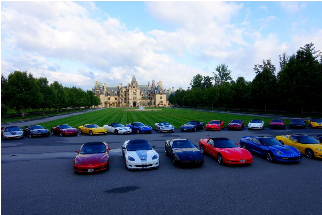
Some members went on the Tail of the Dragon road trip in August 2015. This picture is all of the cars in front of the Biltmore Mansion from a side trip.