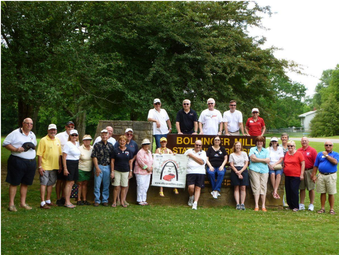
Club members who participated in a mystery run in July 2013. We ended up at Bollinger Mill and naturally had food.