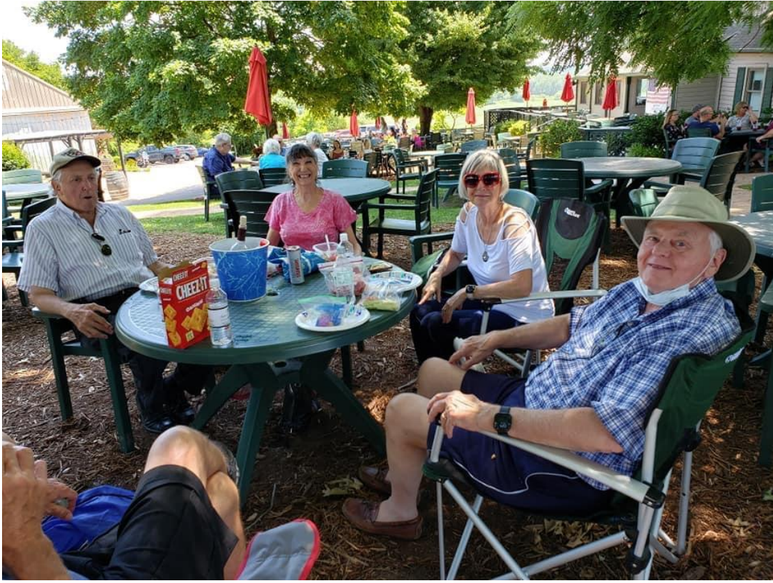
Drive your Corvette to the winery was in June 2020. Notice the new fashion accessory that was all the rage – yes a mask!