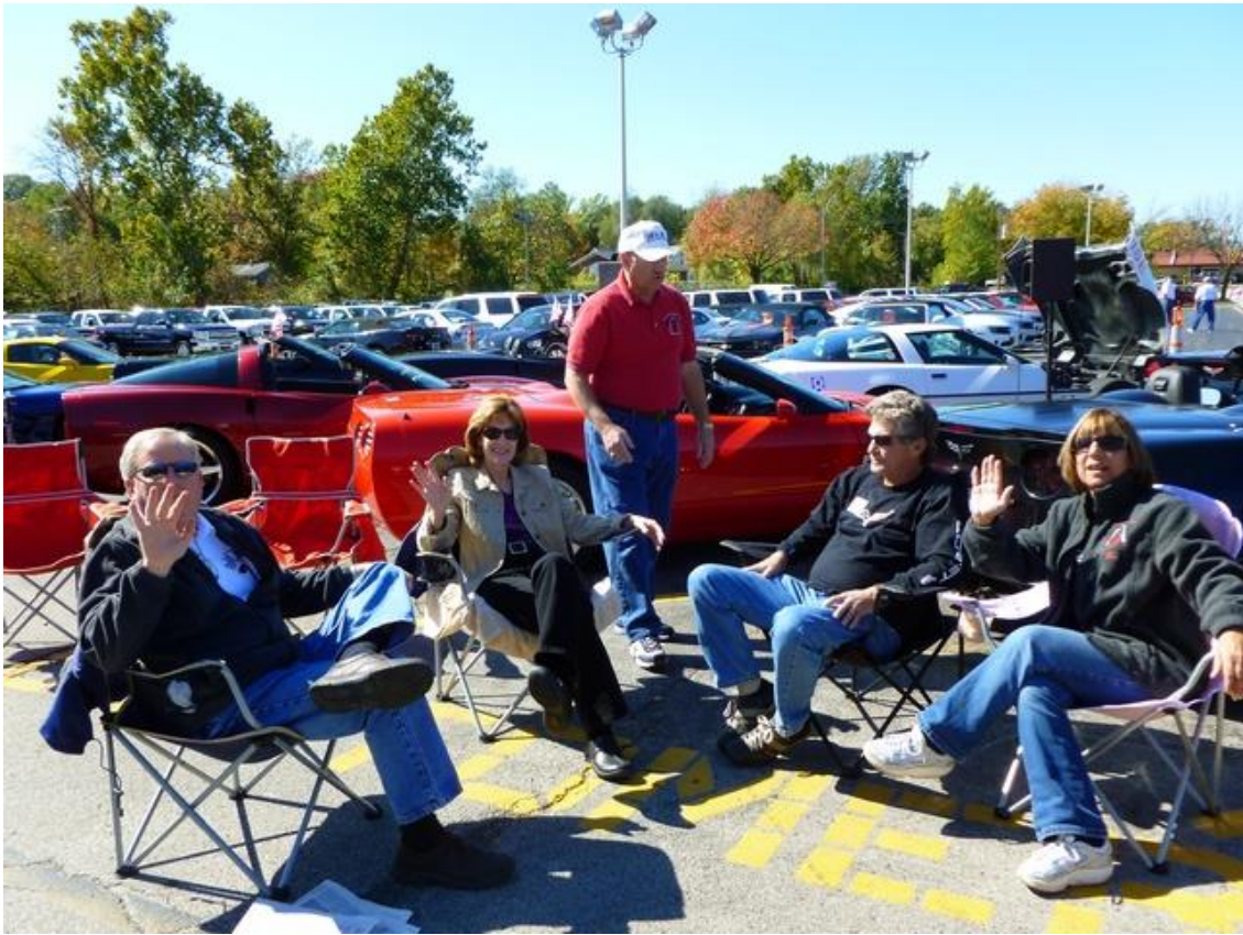
A few club members trying to digest their food from the ELCO car show and chili cook-off in October 2011.