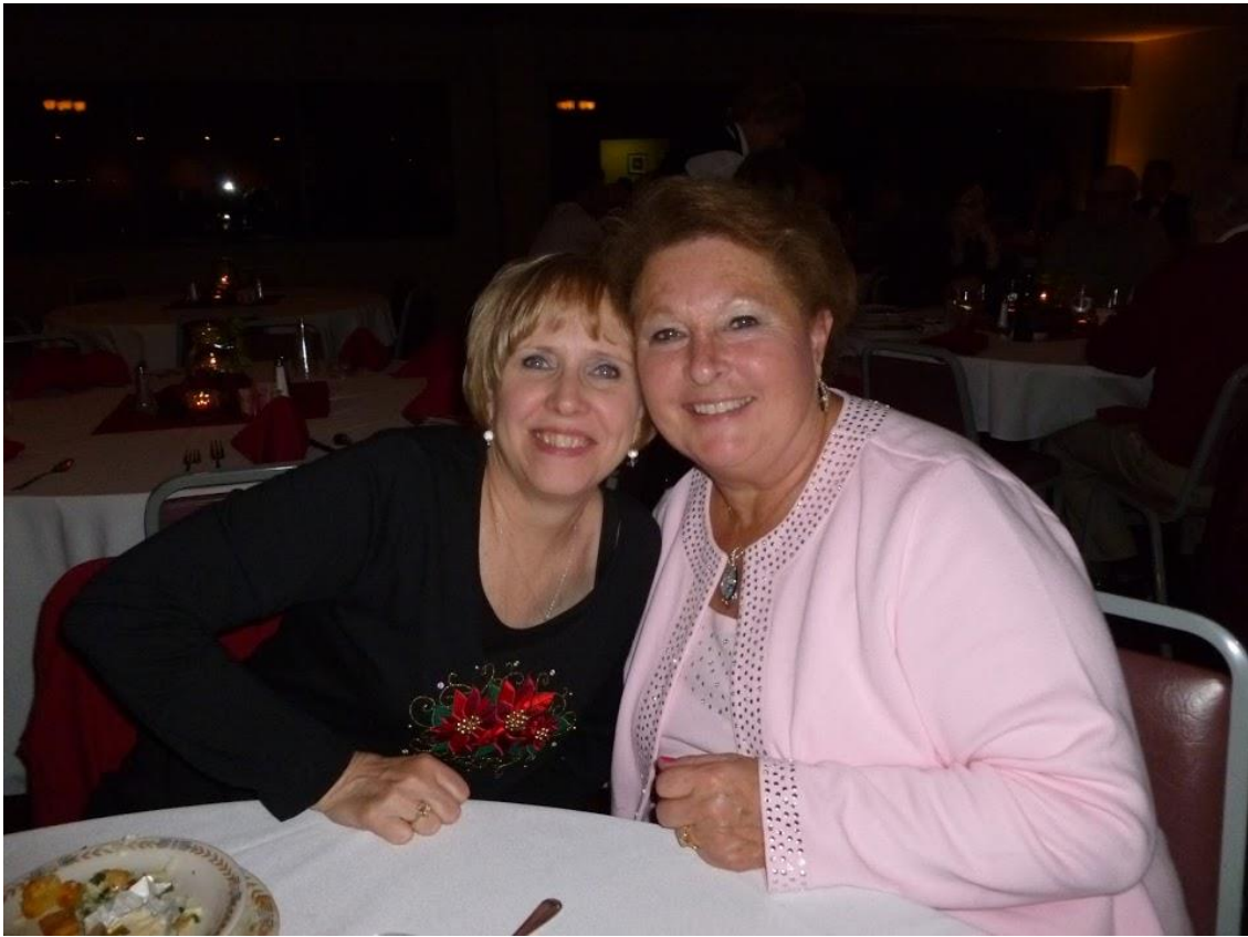
STLCC Christmas 2012