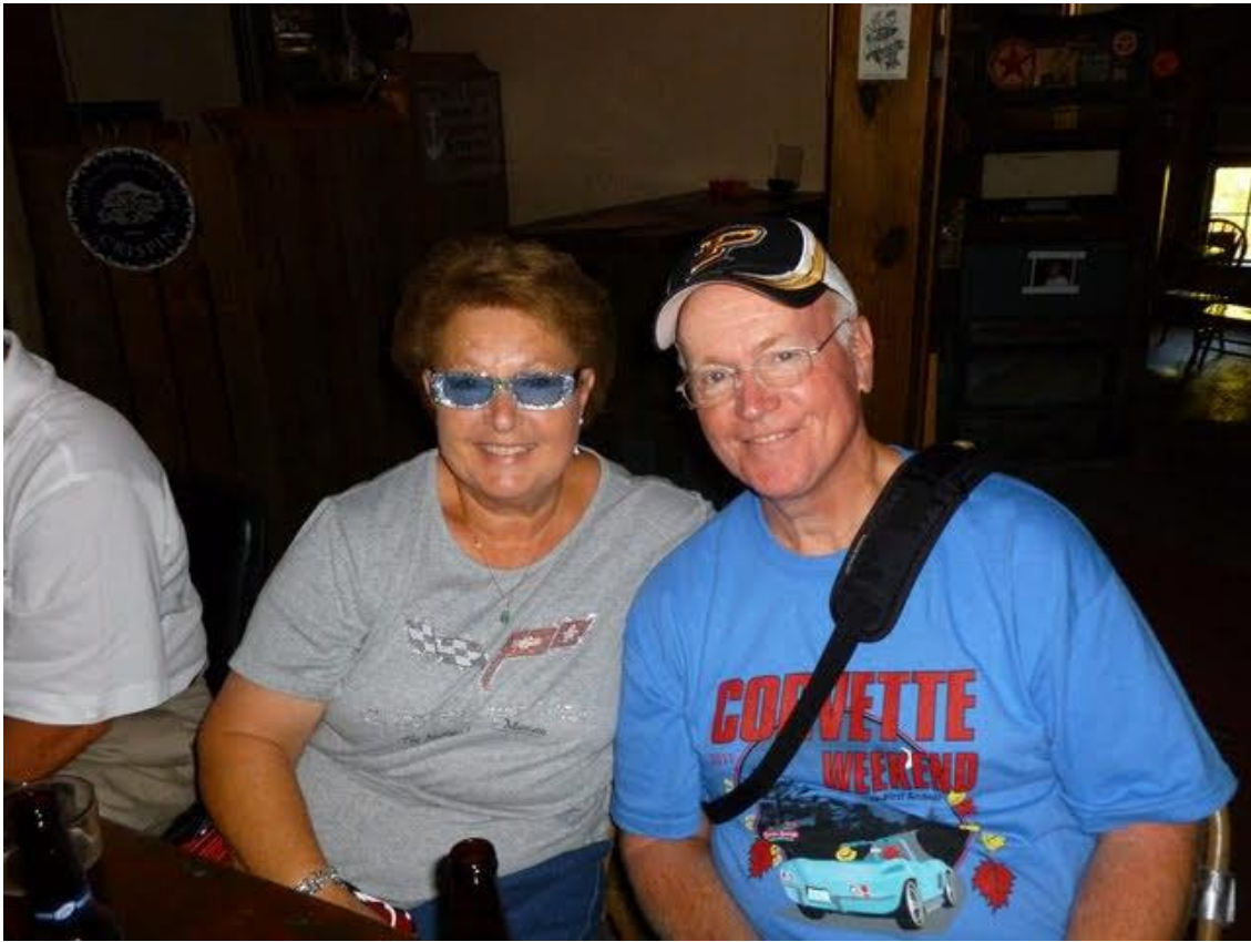
Eureka Springs October 2011