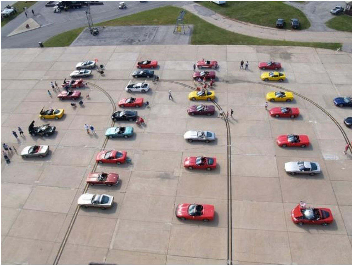
This is an aerial shot of some of our cars at the Scott AFB open house in 2009.