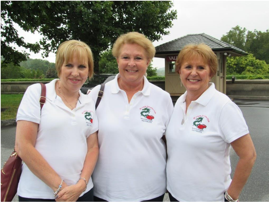
Tail of the Dragon July 2015