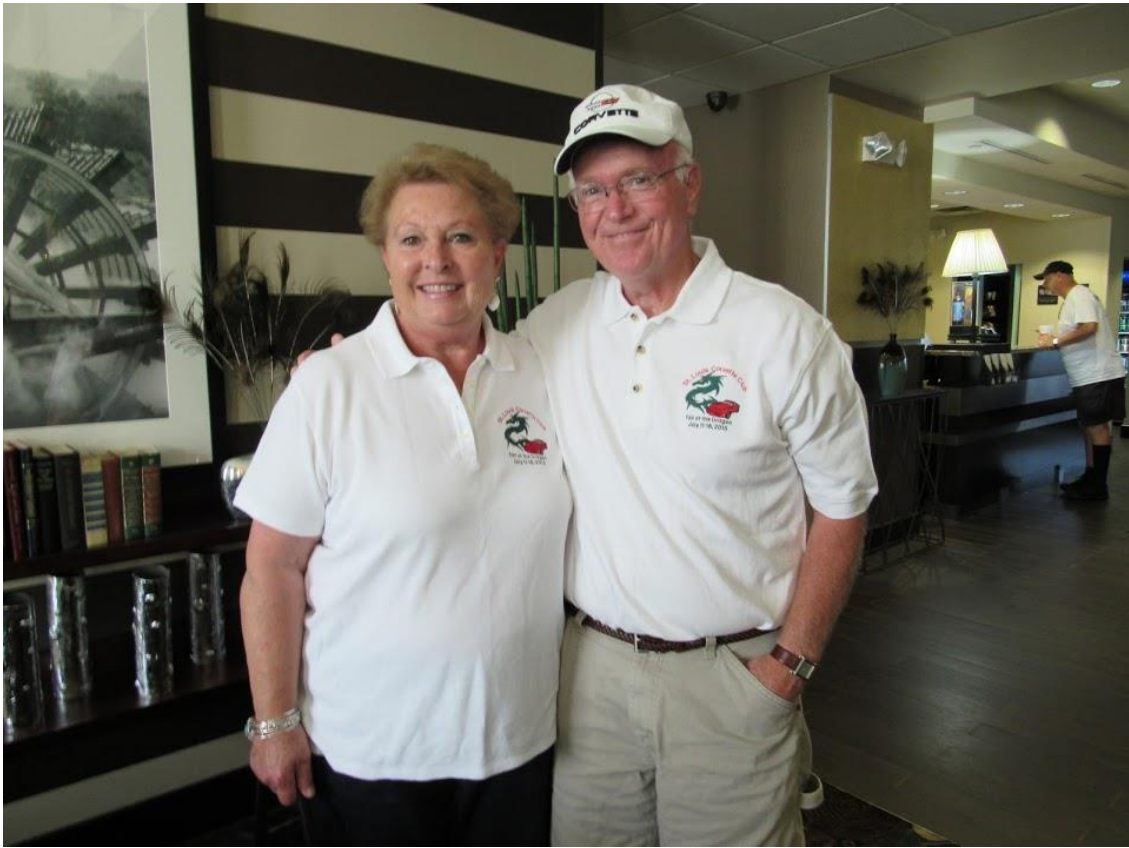
Tail of the Dragon July 2015