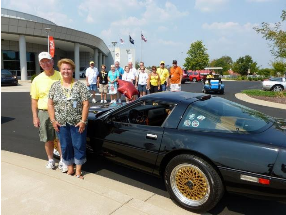
Loves win award at NCM