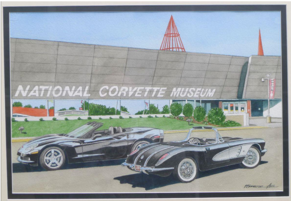
Dana Forrester's watercolor captures the first 50 years of our affection for the Corvette.