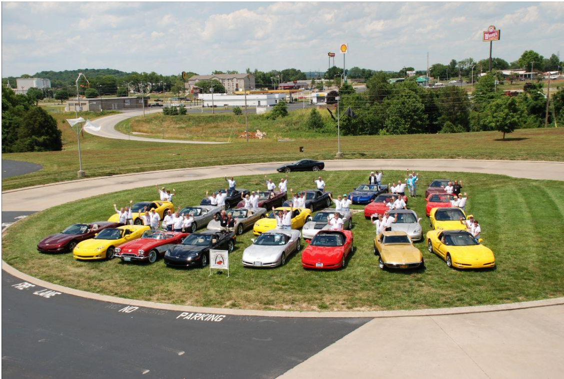
A large group from St. Louis Corvette Club helped celebrate the event.