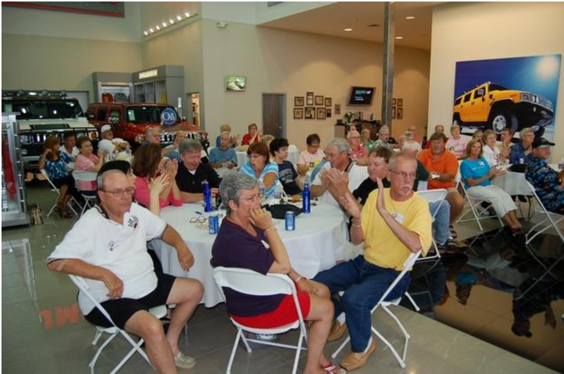
Here is a picture of our club meeting at Lynch Hummer from June 2008.