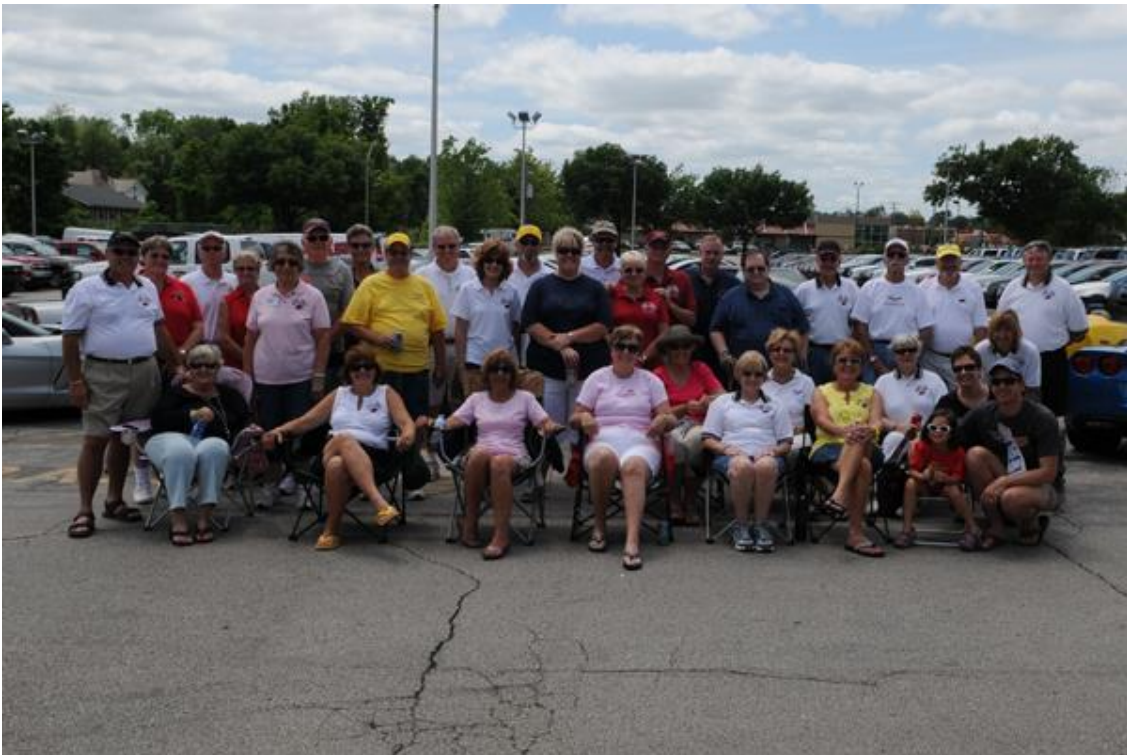
Here is a shot of everyone who participated in the ELCO car show in June of 2011.