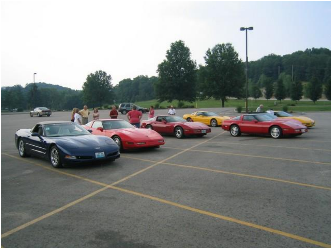
In June of 2007 some of us had a wonderful dinner and wine at the Montelle Winery sponsored by the Prices.