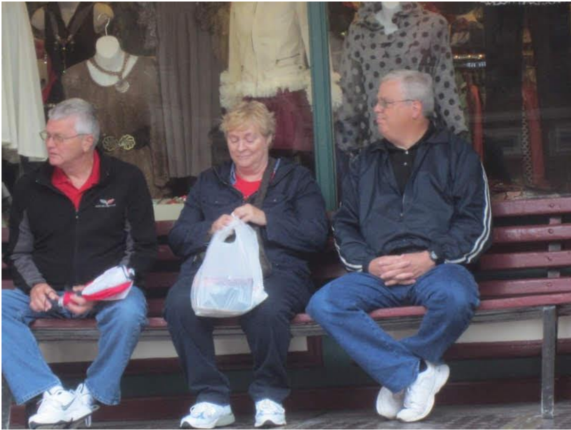
Three old people waiting for the bus to go to Chelsie's in Eureka Springs.