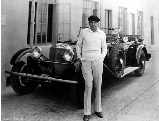
Al Jolson with his Mercedes

I am going to make this a regular feature of the newsletter, at least for a while. A friend sent me several emails of old and unique cars. I have probably over 50 pictures I'll include in the next several newsletters. Here are just a few. I hope you enjoy!