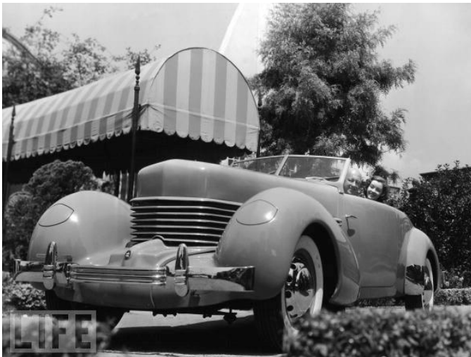
Cecil B. DeMille and his wife in his 1937 Cord