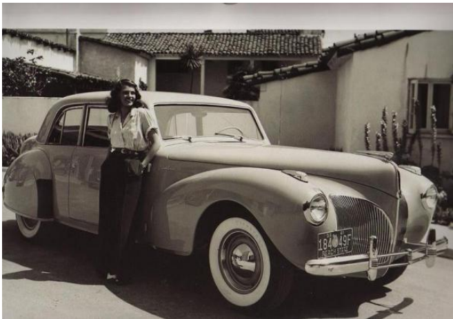
Rita Hayworth with 1941 Lincoln Continental