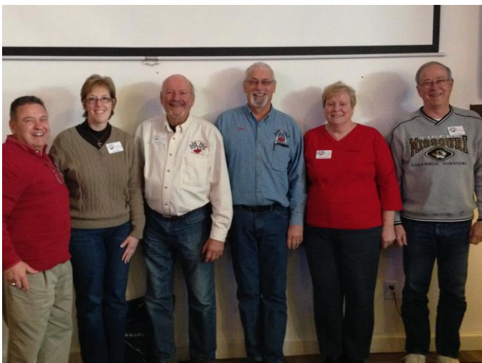
Your 2015-2016 Board