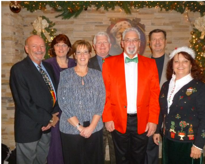
Your 2014-2015 Board