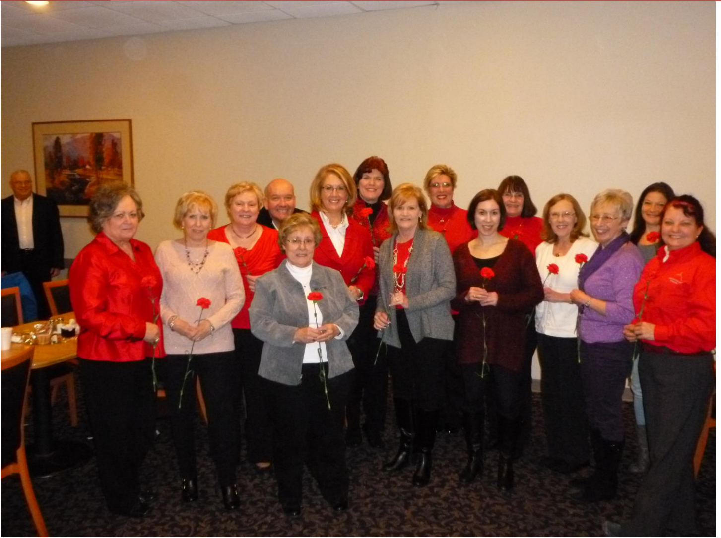
All of our sweethearts!

BE SURE AND CHECK OUT ALL OF THE PICTURES ON THE CLUB'S WEBSITE