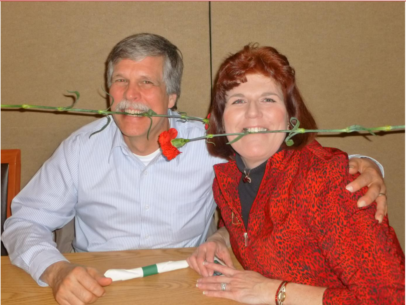
Crazy new grandparents!