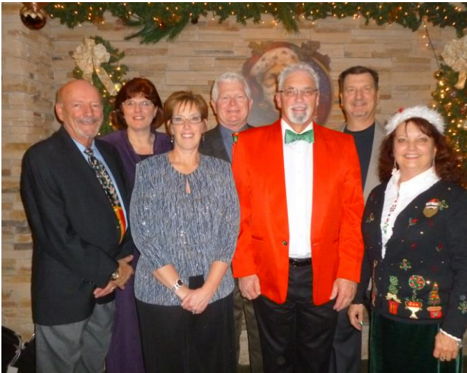
Your 2014-2015 Board