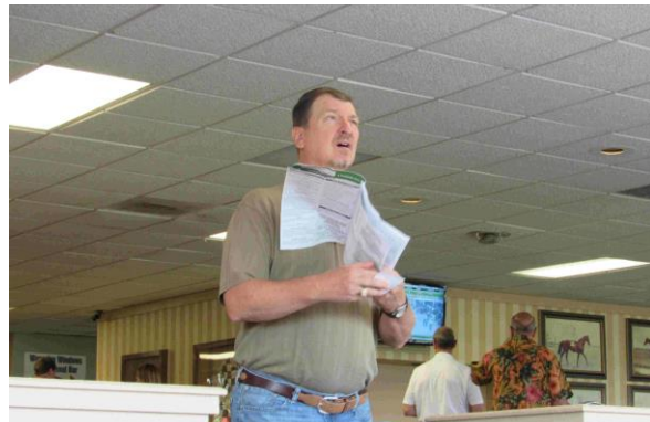
The look you get when your horse falls asleep at the starting line!