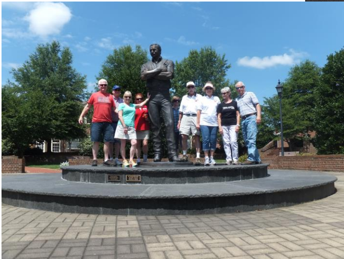
Some of the club members at the Dale Earnhardt Sr. statue.