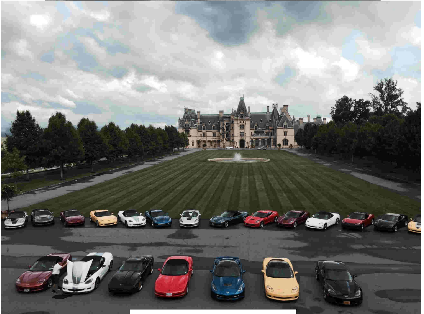
Why are these cars parked in front of Pickles' new house? And is that Randy with the hood up and fluid under the car?