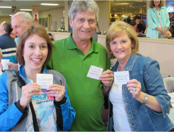
We all got our AARP cards!