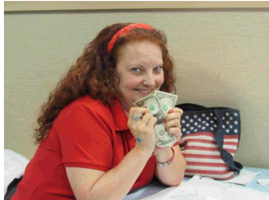
This picture has been sent to the IRS