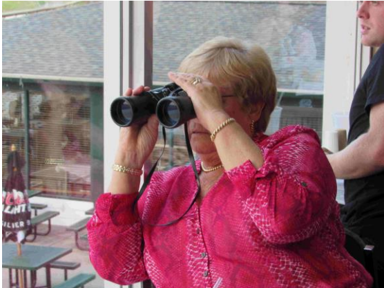
Hey guys, you should see what this couple is doing in their car!