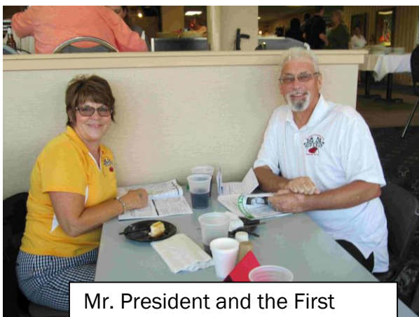
Mr. President and the First Lady