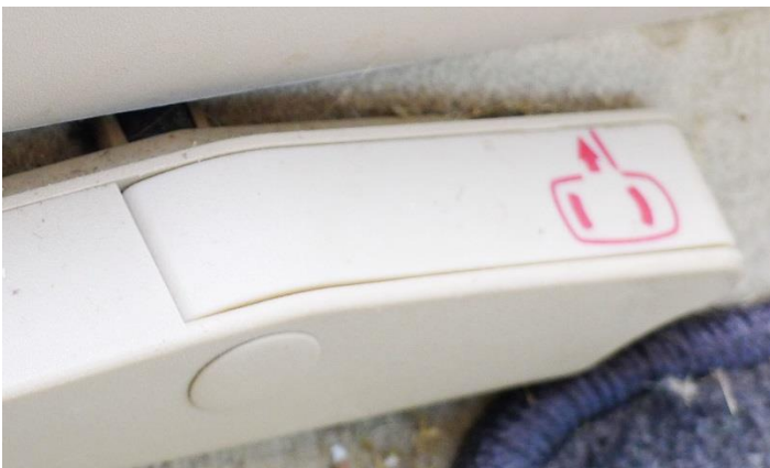
Open Key Fob

Door release handle next to seat and door frame.