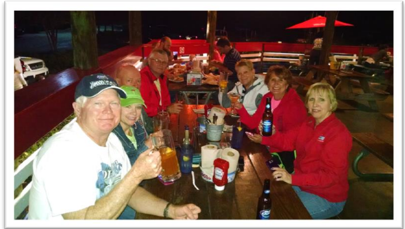
Club members at dinner in Talladega