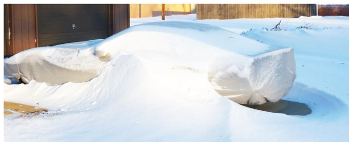
Remember last winter? - Jerry Craig