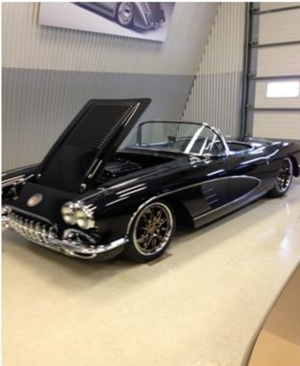
1958 Corvette Detroit 1 st Place Winner