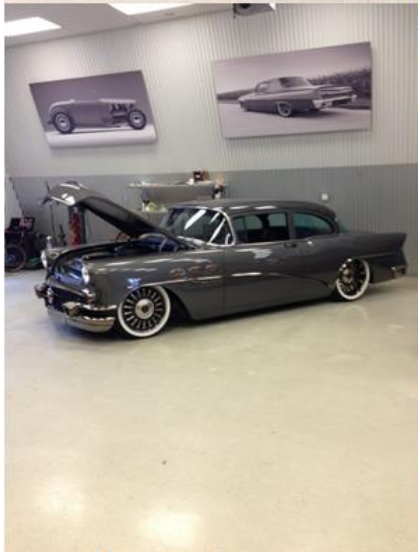
'54 Buick "Nailed"