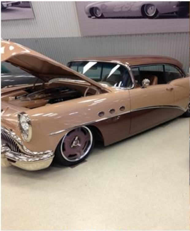
I think this is a '56 Buick