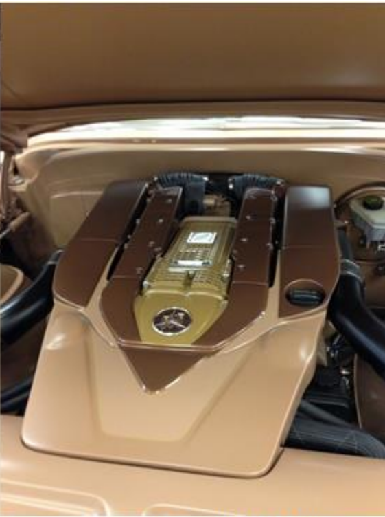
Mercedes Engine in the Buick