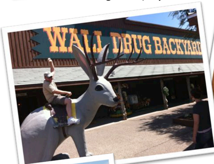
Rumor has it Kevin's jackalope has a big block