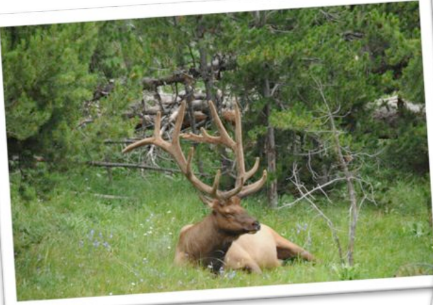
“Where the hell did all these Corvettes come from? Man, I shoulda brought my camera today.”