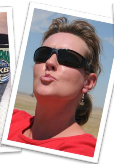
Strike a pose