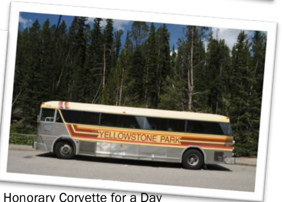
Honorary Corvette for a Day