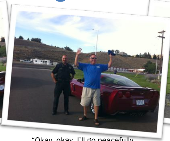
"Okay, okay. I'll go peacefully. Is there anything I can do to make this go more smoothly?"