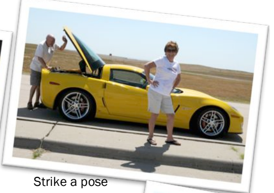
Strike a pose