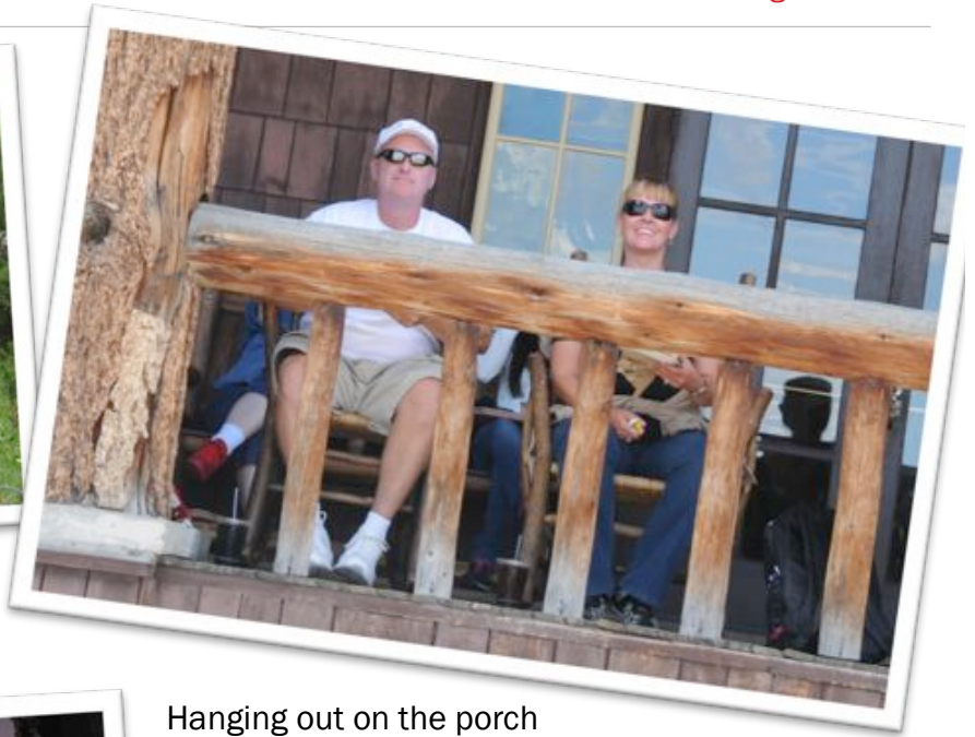
Hanging out on the porch