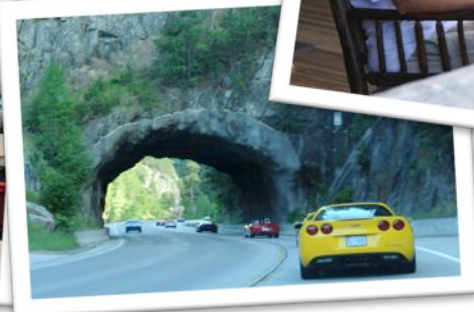
Heading through the tunnel