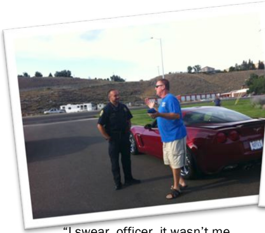
"I swear, officer, it wasn't me. It was my wife! Look at the license plate!"