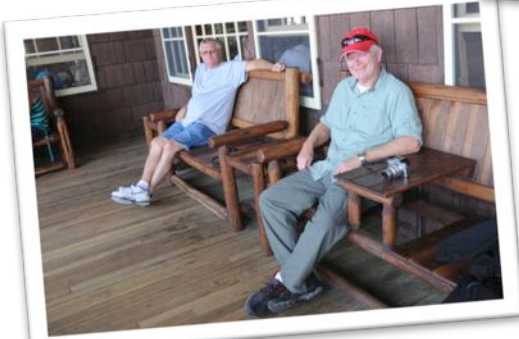
Waitin' for Old Faithful. And for the women to fetch the grub.