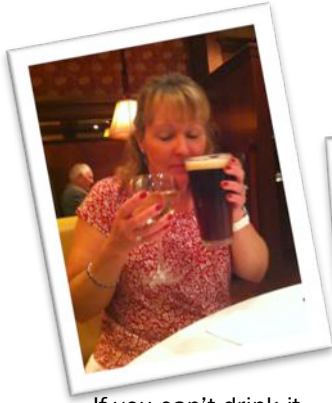
If you can't drink it, sniff it