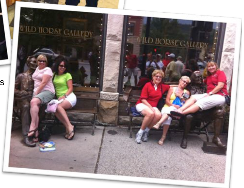
A brief respite between gift shops