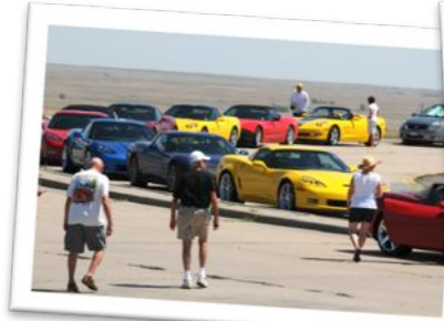
Turns out if you yell, "Horse trailer!" Corvette owners sprint back to their cars.