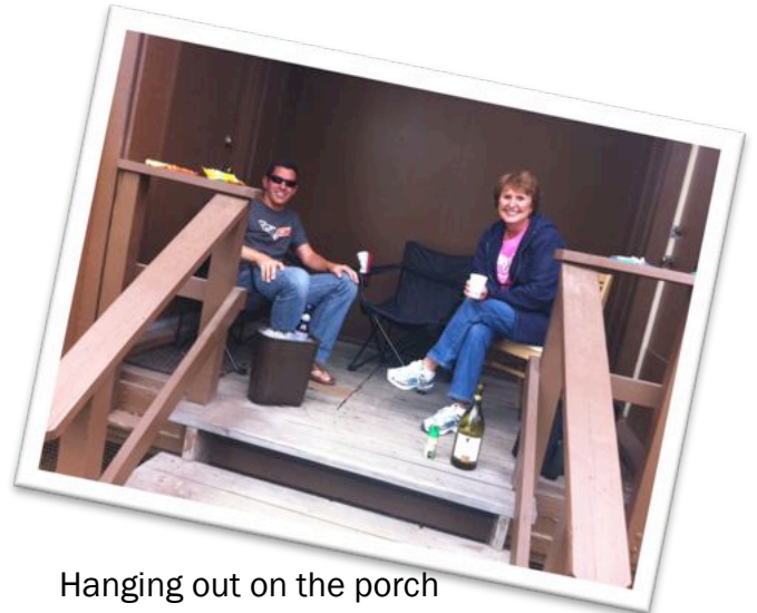
Hanging out on the porch