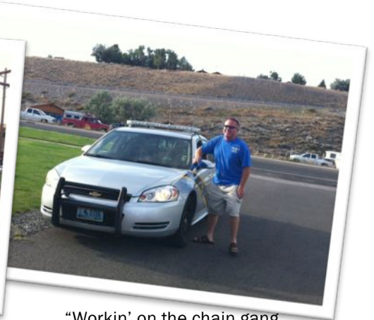
"Workin' on the chain gang... or detailing a cop car. Whatever it takes!"