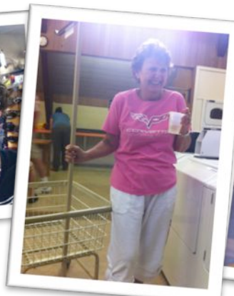
A little "lemonade" makes laundry fun