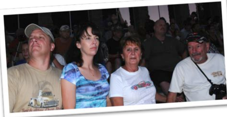
“Hey, let’s be Mt. Rushmore!” “Ummm, okaaaay.”