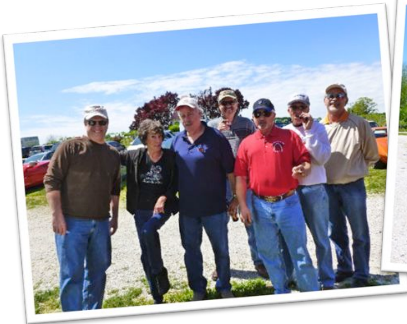
Happy wines Club members!