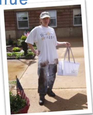
The spring fashion trend includes mud this year