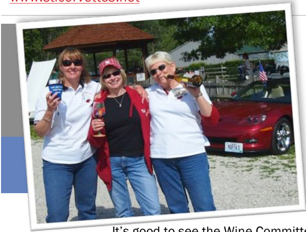
It's good to see the Wine Committee is hard at work again.