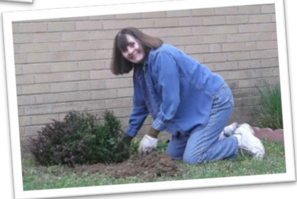
If you guys are this happy to garden, I've got a yard that needs some work...