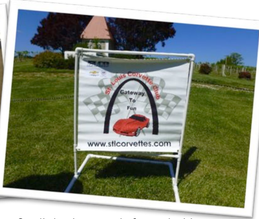
Our little sign travels far and wide