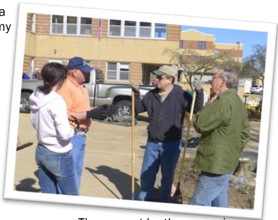
These must be the supervisors