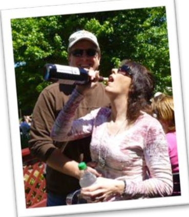
Vikki, hon, take the cork out first.