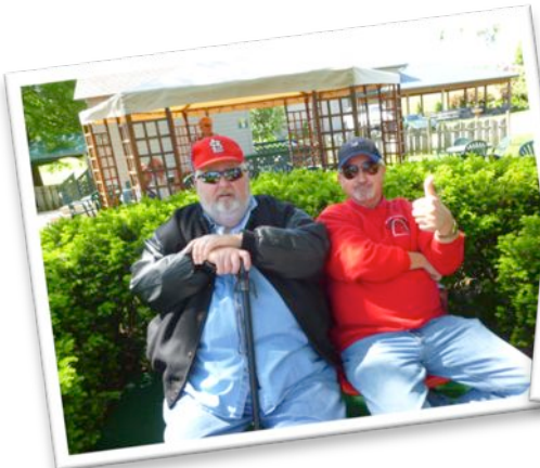
Isn't retirement great?