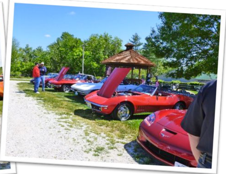
The view at the winery is always improved with the addition of some beautiful cars.