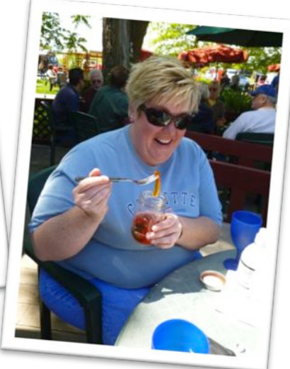
Who wants a gummy worm? I mean a rummy worm. I mean a rummy gummy worm!