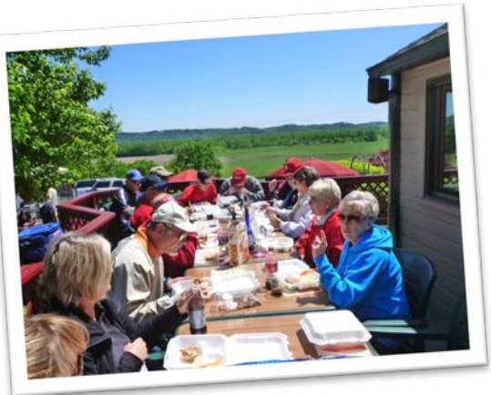
Lunch is served! (We need some way to dilute the wine we've been drinking.)