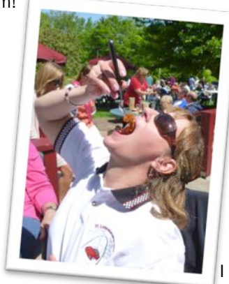
I do! I do!