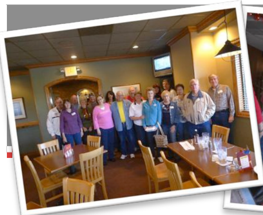
Miller's Grill Run