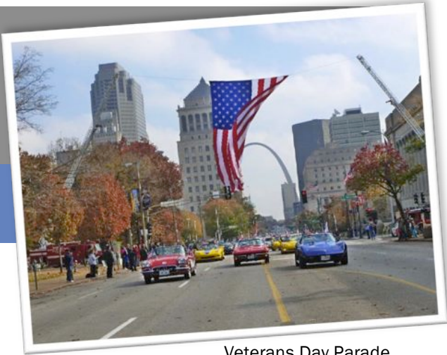
Veterans Day Parade

Couldn't make it to the meeting? Find out what you missed (or what we volunteered you for) here. We meet the first Tuesday of each month at Sunset Hills Banquet Center, 13366 W. Watson Road. 5:30 p.m. open bar, 6 p.m. buffet dinner ($12), and 7 p.m. meeting.