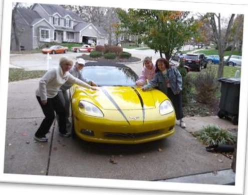
Ooooooo! Stripey goodness!