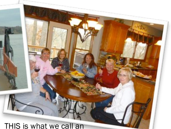
THIS is what we call an "oil change party!"