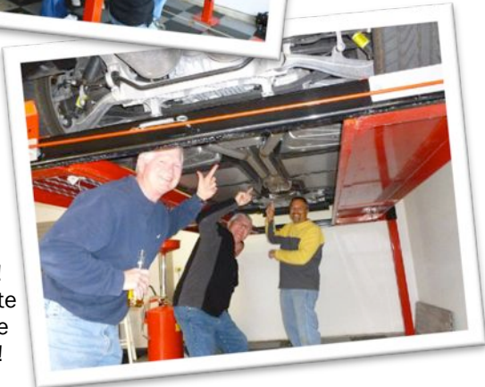
Look! Corvette private parts!