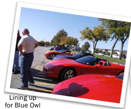
Lining up for Blue Owl

Blue Owl, Warbirds, Veterans Parade, Moonlight, Horstmeyers, Miller's