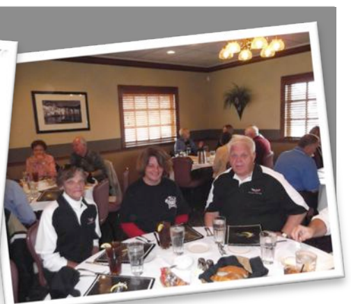
Moonlight Chicken Run