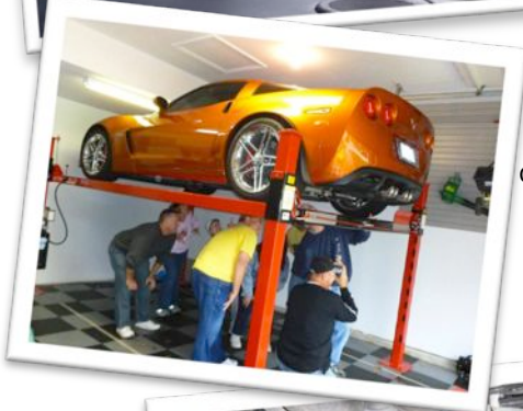
How many club members can we fit under one Corvette?