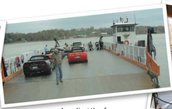
Loading the ferry