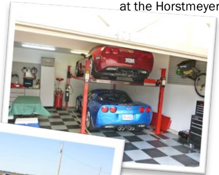
They double-stack 'em at the Horstmeyers