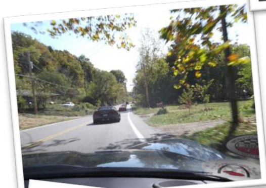
Gorgeous scenery on the way to The Blue Owl