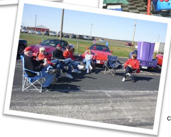
Nothing better than chilling on the tarmac