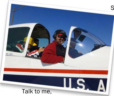
Talk to me, Goose!