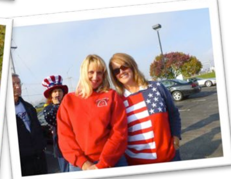
Showing patriotic spirit