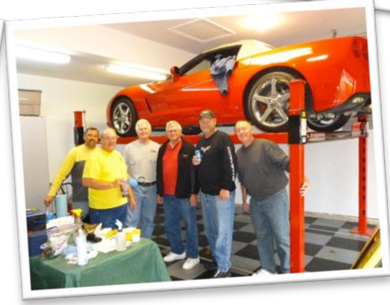
The pit crew