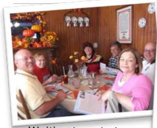
Waiting to eat at The Blue Owl