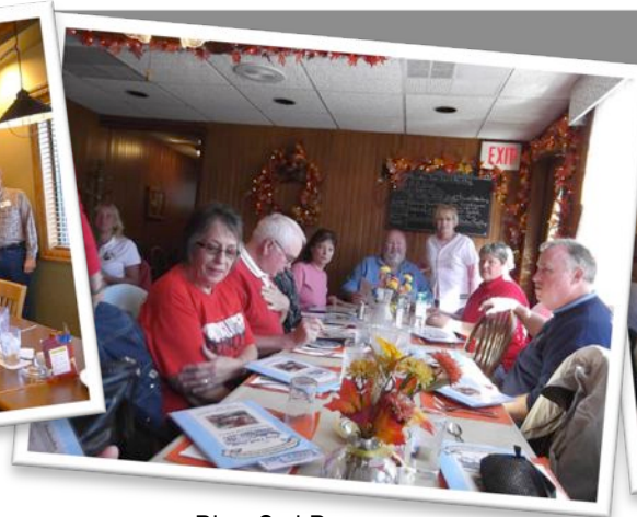
Blue Owl Run