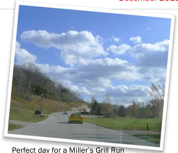
Perfect day for a Miller's Grill Run