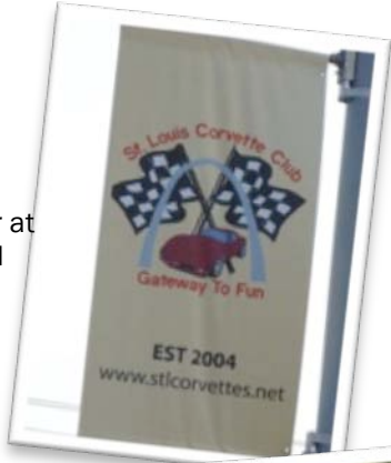
Our banner at NCM