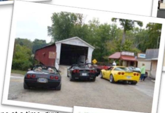
One at a time, guys. Take turns!