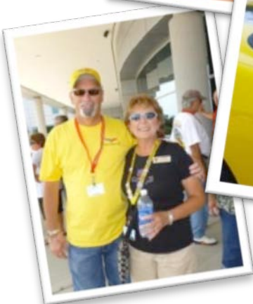
Founding members of Club Yellow. Yellow yellow bo bellow, banafana fo fellow...