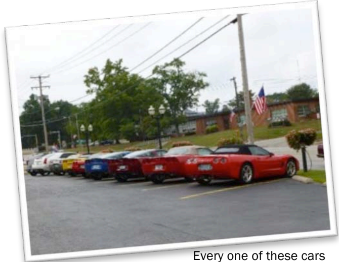
Every one of these cars was driven by a CHICK!