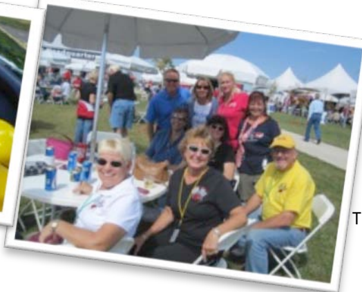
The FunFest Gang, hangin' out