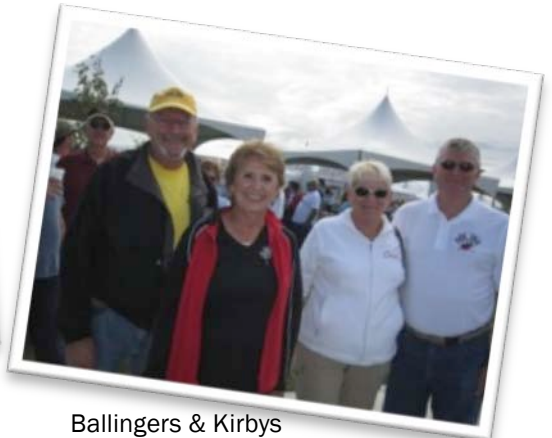
Ballingers & Kirbys