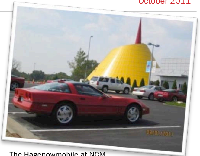
The Hagenowmobile at NCM