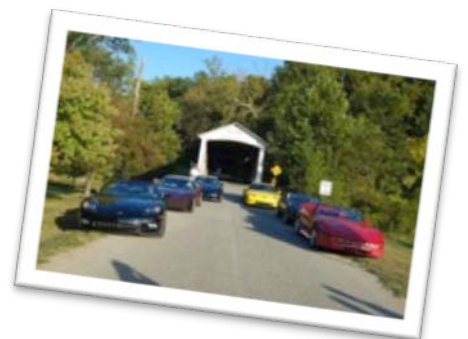
Cool Corvettes and a Covered Bridge