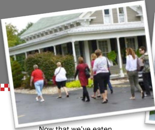
Now that we've eaten... time to shop!