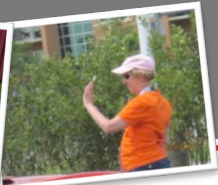
C'mon back...c'mon back...c'mon back STOP!