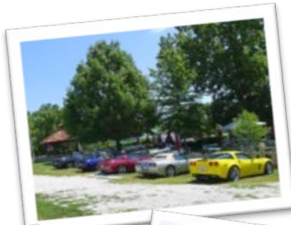
Corvettes at a winery