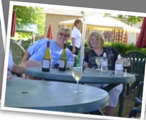
How many bottles of wine do two women need?!