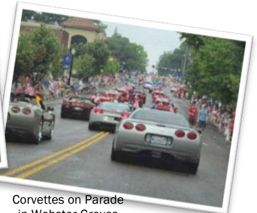
Corvettes on Parade in Webster Groves