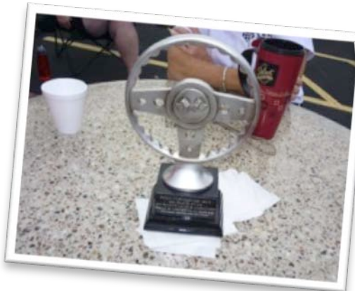
Theresa scores a trophy at the NCCC Convention