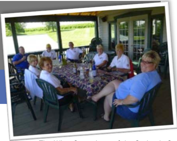
The Wine Committee of the St. Louis Corvette Club celebrated Drive Your Corvette to Work Day with, well, wine. What else?

Couldn't make it to the meeting? Find out what you missed (or what we volunteered you for) here. We meet the first Tuesday of each month at Sunset Hills Banquet Center, 13366 W. Watson Road. 5:30 p.m. open bar, 6 p.m. buffet dinner ($12), and 7 p.m. meeting.