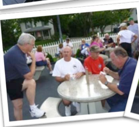
The dog days of summer call for cool treats at Fritz's