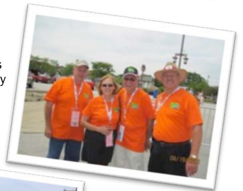
NCCC Volunteer Crew