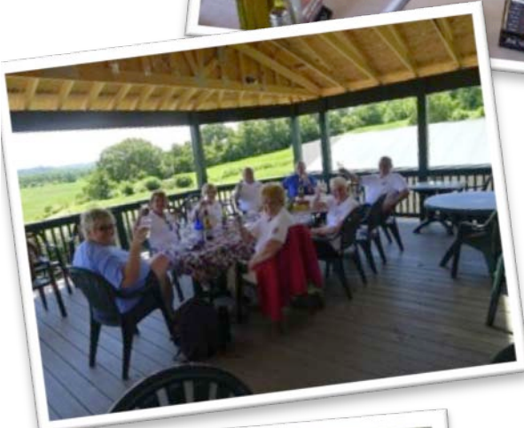
New tradition: Drive Your Corvette to a Winery Because You Don't Have To Go To Work Day