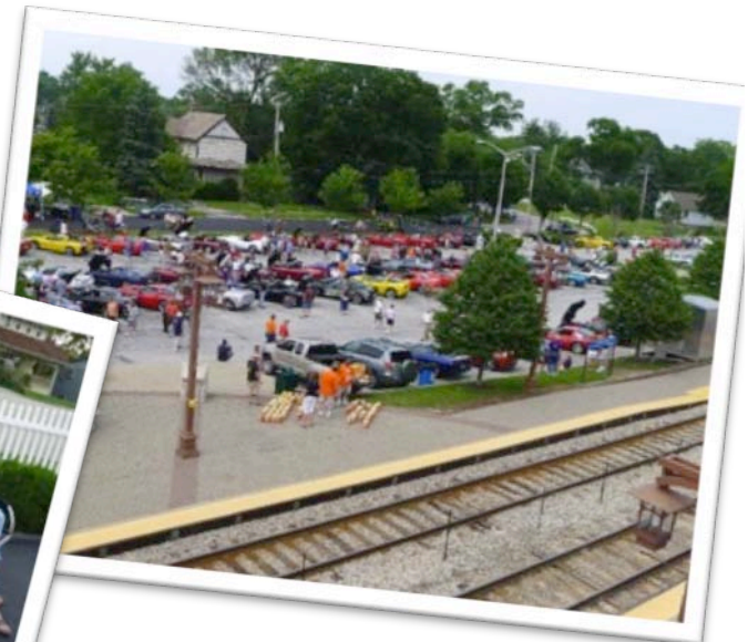
Tinley Park, Illinois, became the most beautiful place in the world during the NCCC Convention