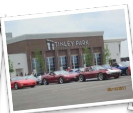
Corvettes in Tinley Park