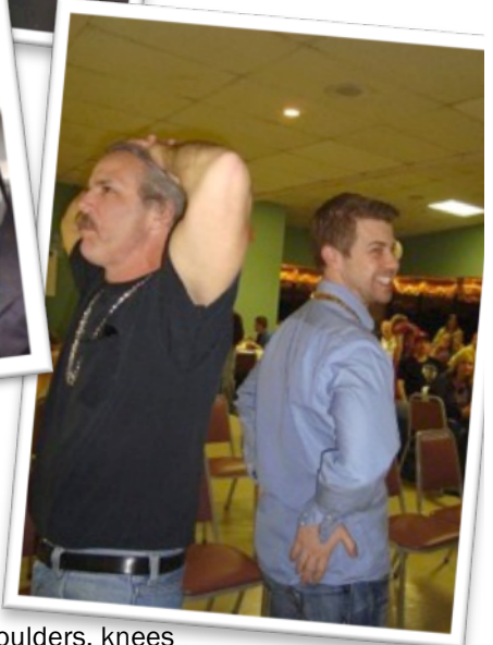
Heads, shoulders, knees and...butts?!