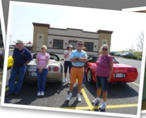
GeoCachers and their Vettes...ready for action!