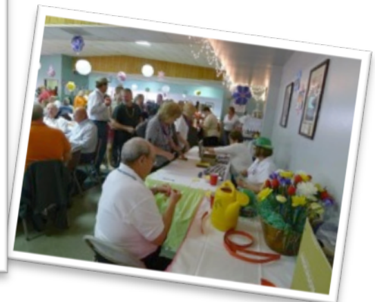
Looks like we may need a larger venue for future Mouse Races – we're popular!