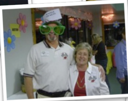
We've heard of rose-colored glasses...