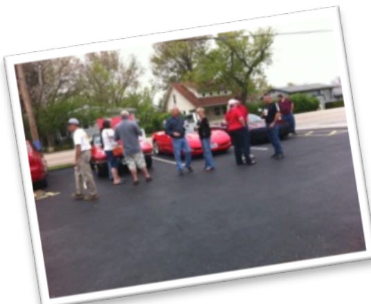
We had a prospective member join us April 17 for ice cream!