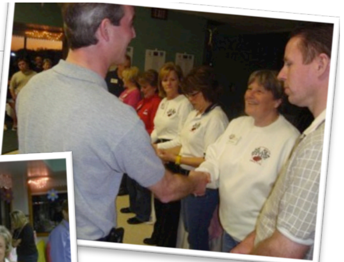
Mouseketeers receive the Challenge Coin