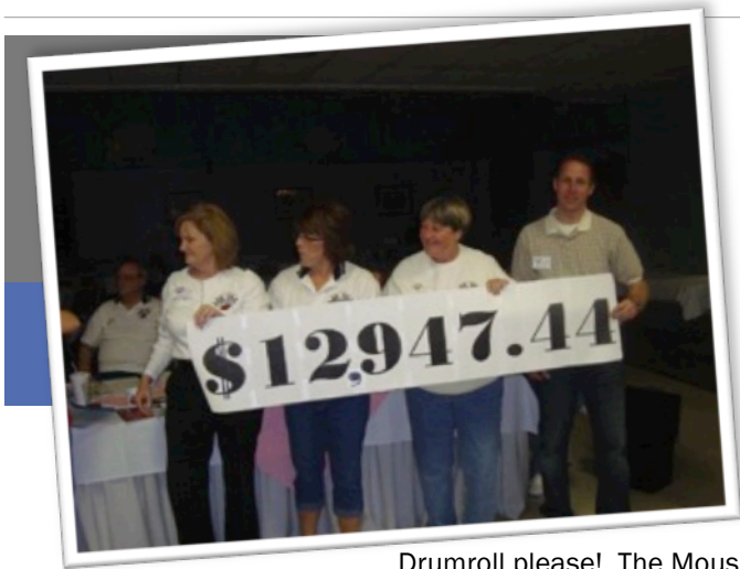
Drumroll please! The Mouse Races raised almost $13K!

Couldn't make it to the meeting? Find out what you missed (or what we volunteered you for) here. We meet the first Tuesday of each month at Sunset Hills Banquet Center, 13366 W. Watson Road. 5:30 p.m. open bar, 6 p.m. buffet dinner ($12), and 7 p.m. meeting.