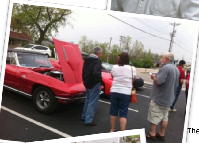
The new big block attracts attention at Fritz's