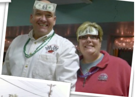
Show me the money!