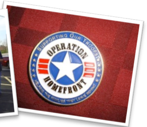
Front of the Challenge Coin presented to Mousketeers. Challenge them at the bar at the next meeting and see who has to buy a drink!