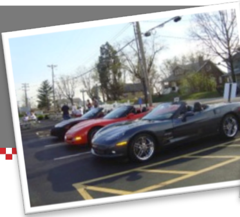
Corvettes line up for their frozen custard