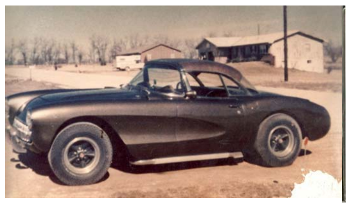
This was my Dad's 56 circa 1972