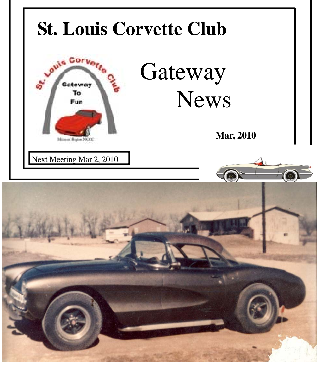
My Dad would of thought this was cool that his old vette made the cover