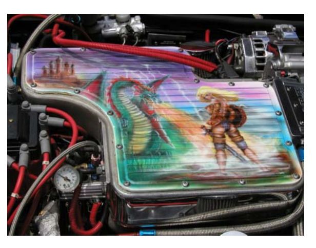
Cool engine compartment of someone's

Anyone who would like to share past owned vettes, modifications made or anything you consider cool, I'll be glad to include it in future newsletters.