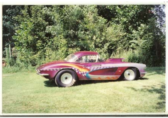
This belong to my son's Father-in-Law