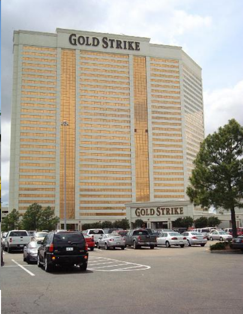
BROKE, HAPPY, FULL, SILLY AND SPECIAL PARKING