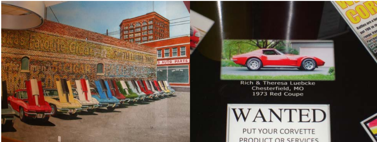
SOME MORE PICTURES OF THE NEW MUSEUM. A WALL MURAL PAINTED BY DANA FORESTER AND RICH LUEBCKE PICTURE MADE IT ON A TABLE IN THE CAFÉ.