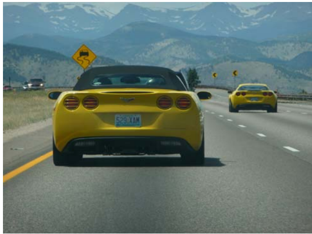
SOME CAME FOR THE SCENERY