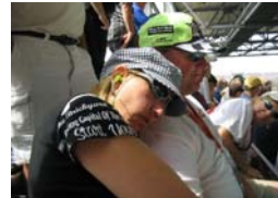
SOME COUPLES FROM THE CLUB AT INDY