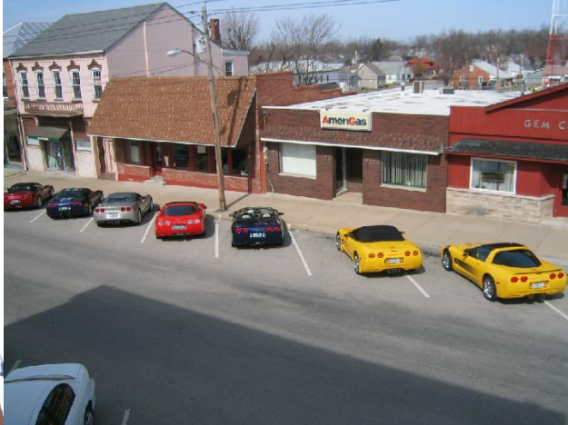
TIME TO CHOW DOWN