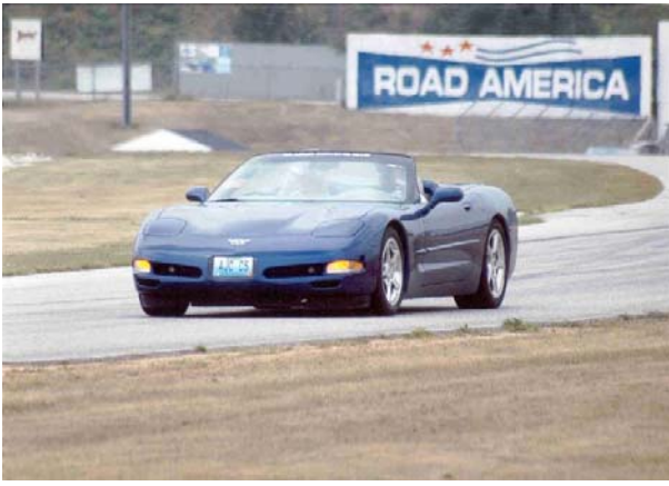
JERRY HAVING A LITTLE FUN