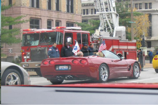
A COLD DAY FOR THE VETERAN'S DAY PARADE. SOME PICTURES FROM THE PARADE AND THEN A COUPLE AT THE HOSPITAL