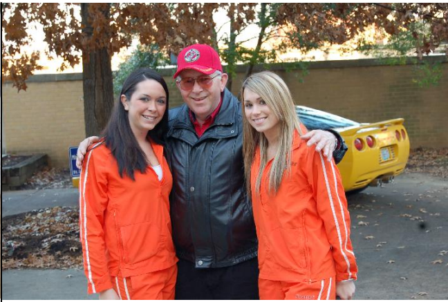
LES HAVING A LITTLE FUN ALSO