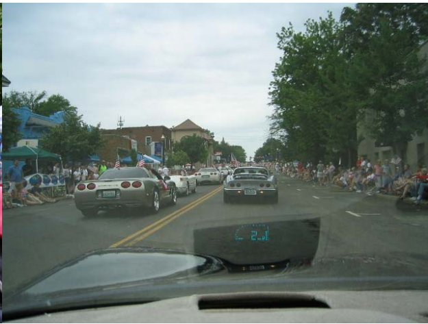
MORE PICTURES FROM THE PARADE AND PICTURES FROM THE DREAMLAND RESTAURANT RUN