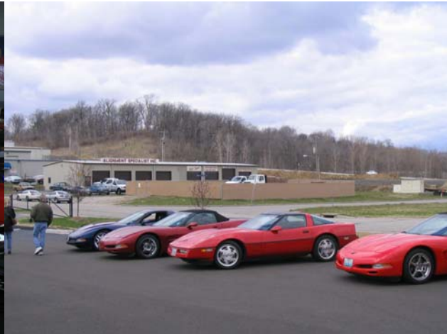
BLUE SPRINGS ROAD TRIP