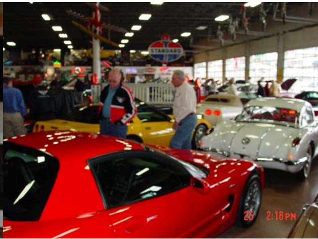
FAST LANES VISIT