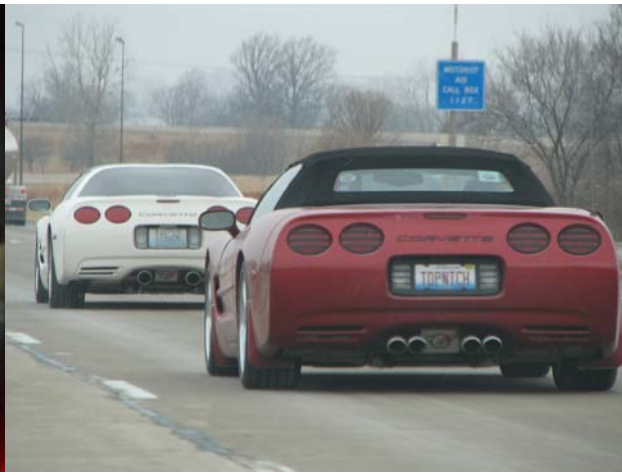
VALENTINE DAY AT SCOTT AIR FORCE BASE. I HEARD NO ONE LEFT HUNGARY