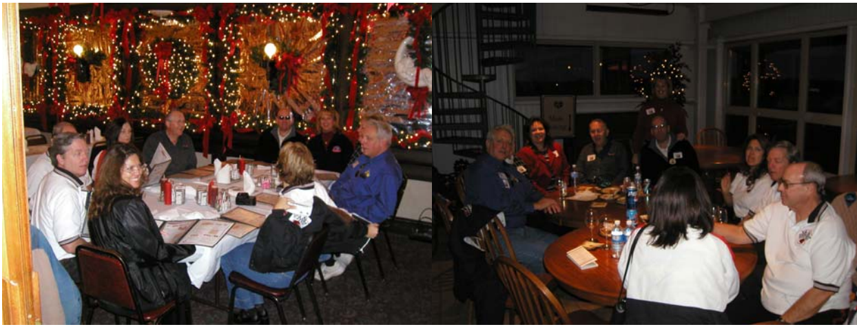
WE ATE, SAMPLED WINE, WATCH THE SUNSET AND PLAIN JUST HAD TO MUCH FUN