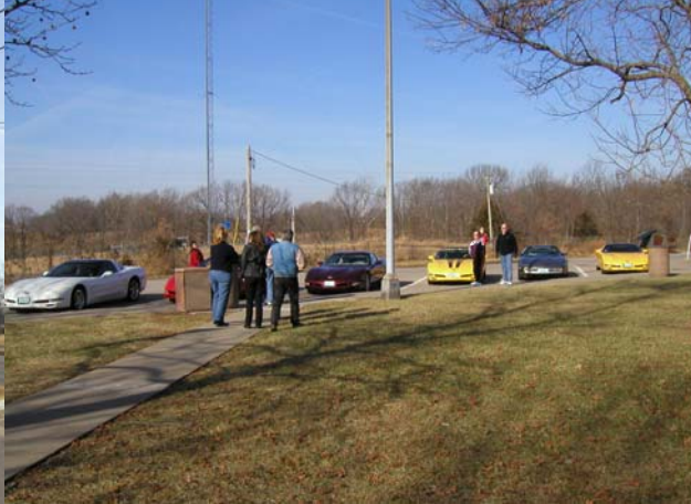
ON OUR WAY TO HICKORY LOG AND CROWN VALLEY WINERY. WOO HOO