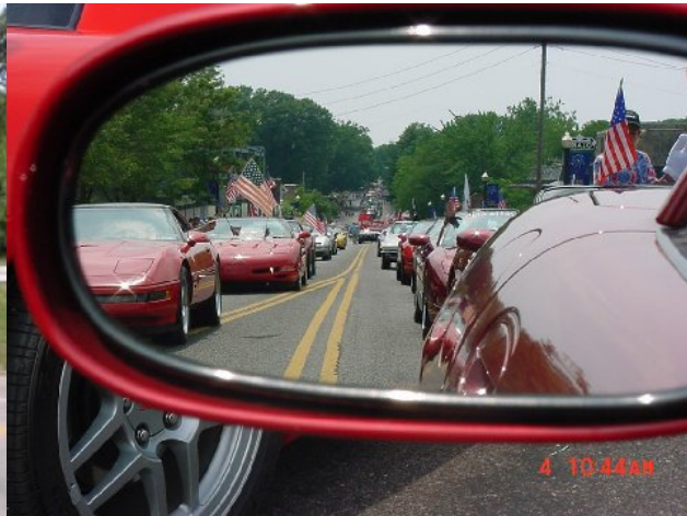
WEBSTER GROVE PARADE