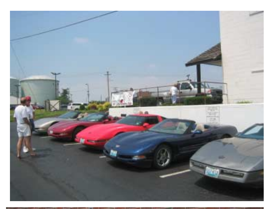
Route 66 Car Show