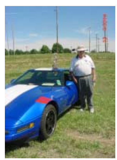
Trophy Winners from the Route 66 Show.