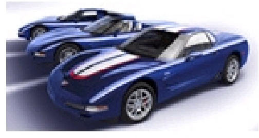
"<u>The Last C5's</u>" Raffle